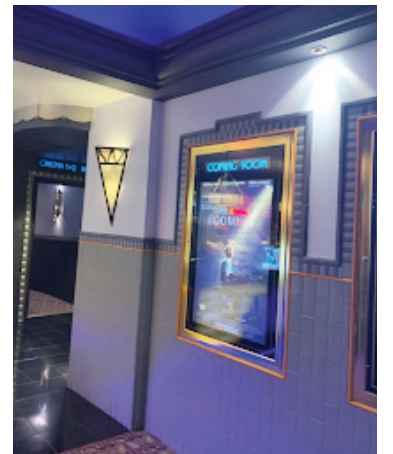
Interior photo of Los Feliz Theater in East Los Angeles, where the audience watched Don't Look Up.

but director Adam McKay told the story in a messy and unpropitious way. The film is recommended to others, but it did not meet my expectations. Perhaps they should have taken notes from one of their own lines, "You're just telling a story. Keep it simple. No math."