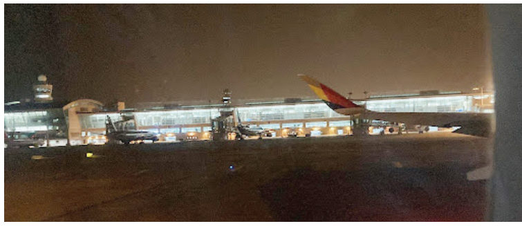
At ICN airport safety measures are taken to help contain the spread of COVID-19 and its variants..

The COVID-19 pandemic changed many aspects of our daily lives, including traveling internationally. In fear of spreading the virus, many areas placed travel restrictions such as entry bans and quarantines, making the process of entering a country tedious. These regulations also apply to an individual's vaccination status. Currently, the Center for Disease Control, CDC, recommends people who are not fully vaccinated should refrain from traveling internationally.