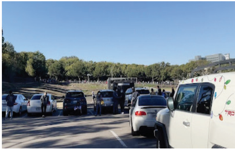
Wait Lines Wrapping Around the Whole Block

The new year has begun; 2021 is finally over. As 2022 displayed its qualities, the new variant, also known as Omicron, started to write its own story. The COVID-19 testing sites are starting to get busy again, particularly one in San Marcos, California. On the first of January, the free testing area had lines through