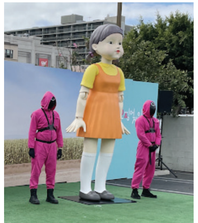
Squid Game pop-up in Los Angeles which came about due to the major popularity it was getting in America.

The last of the 2021 hits would be the drama called My Name. The cast consists of Han Sohee, Ahn Bohyun, Park HeeSoon, Chang