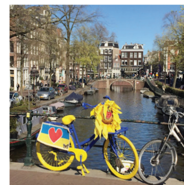
A bike symbolizing support for Ukraine in Amsterdam.

As the war progresses, the topic of main concern is how to help the Ukrainians. Many civilians are using various means to deliver their message to their own governments and to alienate Russia. However, this is not to say that there is no consequence to these actions. While countries are sanctioning Russia and trying to find an appropriate means of discipline which would not endanger their own proliferation, it is up to the people to express economic support and solidarity for Ukraine. It is difficult to forget that Russia is one of the most powerful nations