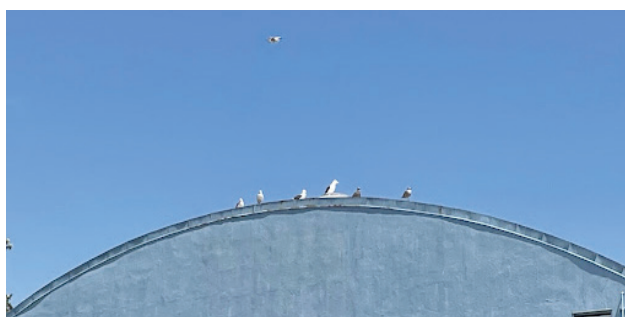
Seagulls perch on top of the school gym, scouring the area for food and their next unsuspecting victim.

It's any other day at Culver City High School. The sky is clear, the leaves sway in the breeze, and the hallways and lunch patios are bustling with students after the highly anticipated lunch bell sounds. And perched on top of the school gym and cafeteria, lined up like an ordered military regiment, are seagulls menacingly overlooking this lunch scene.