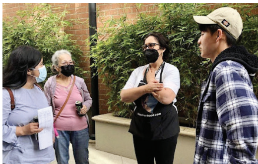
All positive changes require diligent, passionate individuals. Partnering with the non-profit was a great idea!

I was only able to help with support from my classmates and a non-profit organization called Transitions In Motherhood. The company had been helping the refugee families since they arrived in California. The organization's altruistic volunteers devote their Saturdays to collecting, sorting, packing, and delivering donations to make the world a better place. I knew partnering with the non-profit would give my club members a hands-on experience and real-world perspective on the volunteering process.