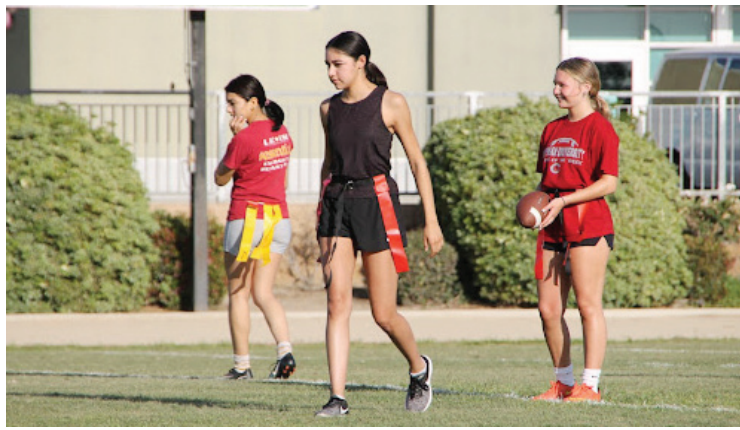
During practice, the players prepare to start another match despite the scorching heat.

Hair flowing in the wind, the players shout excitedly to each other across the field as adrenaline courses through their veins. This time, instead of the usual boys' football team, the girls of Troy High School are preparing on the football field. Bringing back the tradition from before the pandemic, the football team presented a sports competition on April 8.