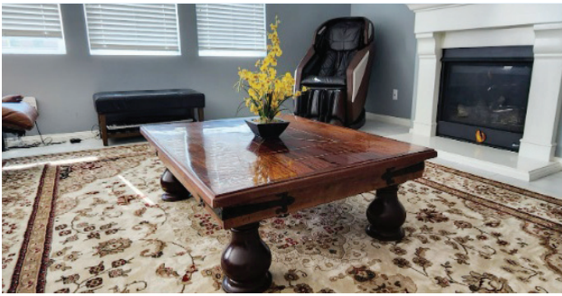
Personally, my favorite example of an interesting flea market find would be this wooden, handcrafted table.

Signs promoting a yard sale are common to many, but an individual living in a populated area will come to find that flea markets are a similar, but larger-scale genre that has popped up more recently. When thinking about a flea market, the goods that typically come to one's mind include items at a retail price, usually resting on a display table with several similar products nearby. This general knowledge personally came from the student-operated markets that my elementary school hosted; however, walking through columns of students' shops in-