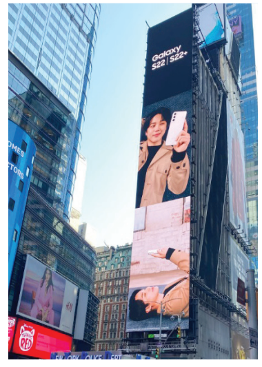
BTS in a billboard advertisement in Time Square.

BTS is currently setting unprecedented records that will remain in the history of K-pop and now stands as an international icon, promoting Korean culture and history to the world. BTS became the first Korean band to top Billboard's main single chart 'Hot