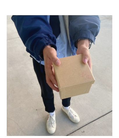
Gift-giving is a common love language.

The main five types of love languages are physical touch, receiving and giving gifts, acts of service, quality time, and words of affirmation. Everybody has their type of love language, and your love language doesn't have to be only one of them. You can have several love languages, and the ways you express them can be unique.