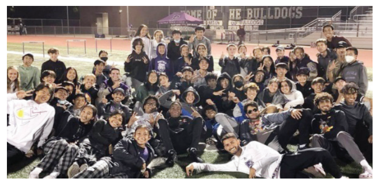
Portola High School's track and field team pose after a team meeting to celebrate their first time as the boy's league champions.

For months, the track teams in the Pacific Coast League, PCL, have been training hard to prepare for the league finals. Hundreds of athletes worked tirelessly to achieve their personal records and outrun their opponents. Whether they practiced their jumping, hurdling, throwing, or running skills, everyone put their blood, sweat, and tears into training. Throughout the season, each school attempted to show off its abilities and estab-