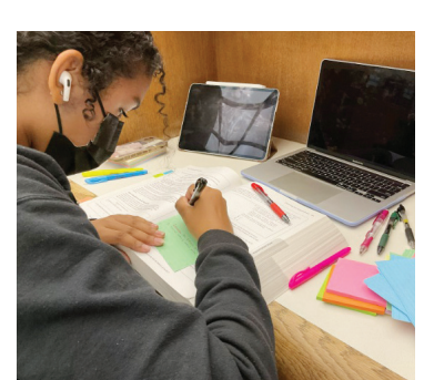
This high school student studies for the upcoming SAT in a public library where she is able to focus well.

First, find the best location to study. Finding a place where you can solely concentrate on your studies for more than 3 hours is theprimarystep. Students have difficulty comprehending subjects as efficiently as when they are in the best location, or take a longer time due to a lack of concentration.