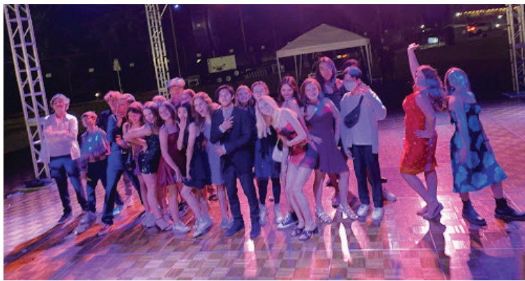
Rosemont Middle School's Student Body are congratulated for all their hard work for the Semi-Formal.

Two weeks before the dance, all students were able to buy their tickets, to attend the show, and din-