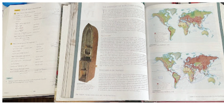
Countless hours of working and studying was put into my sophomore year of high school, and it's safe to say that it was all worth it.

My sophomore year of high school was technically my freshman year in some ways. It was the very first year of attending high school in-person, as my freshman year was virtual due to the pandemic. There were practically two freshman classes this year, as there