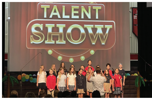
Santa Fe's Sixth Grade Choir/Music Class Performing Their Version of the Many Broadway Shows