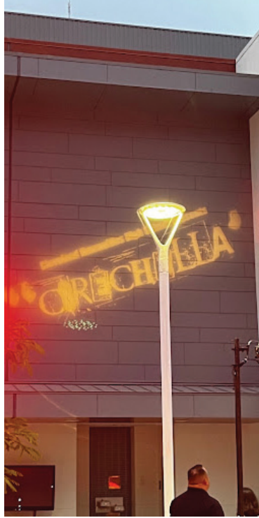
A light projection of Corechella X's logo on a school building

The final exams and project are handed to teachers as the general laziness on campus sets in. As summer nears and the stress of AP exams and finals slowly drift away, Cleveland Charter High School students patiently wait for the special end-of-the-year student-led concert on campus. For the last few months, pupil bands have been diligently practicing and perfecting their songs for their performances. Despite the pressure of the final exams on the students of the organizing committee, the planners have managed to prepare a perfect festival despite the transition from online to in-person.