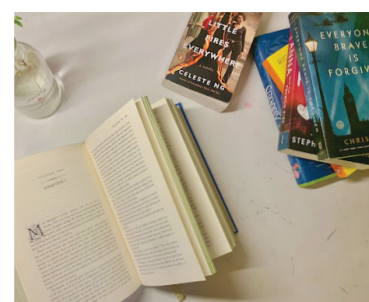
Multiple books are highly trending on BookTok! Are they good or overhyped?

A Court of Thorns and Roses , by Sarah J. Maas, is a fantasy-romance novel that has also been highly lauded on TikTok. Containing all of the internet's favorite tropes—enemies to lovers, curses, and magical beings—it's difficult to scroll through BookTok without encountering this novel. As a modern retelling of Beauty and the Beast , the story follows a girl named Feyre who fights for survival in a world of poverty and a coldhearted family. Then, she is dragged to a magical world where her captor turns out to be powerful, immortal, and extremely attractive. What follows is a slow-burn romance in which Feyre explores her new world and experiences love, adventure, and happi-