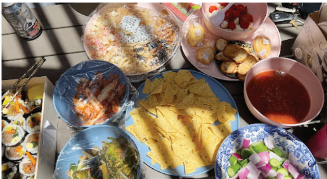
Inspiration from the ideal Korean and Argentinian picnic is seen in this arrangement.

traditions need to be considered to identify the best foods to pack. Because the ideal hours for a picnic are when one is likely to eat breakfast or an afternoon snack, I'd recommend putting a light French breakfast or some dairy items from a farmers market into the cooler. From the romanticized French picnic and its charcuterie board, to the diverse variations of the Korean rice cake, I also suggest that you take inspiration from various