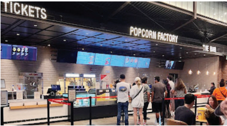
Families and friends, gathered in groups, continuously arrive at the front counter to order their movie tickets, popcorn, hot dogs, candy, and drinks.

Back in 2017, movie theaters were packed and fans waited with excitement to watch the movie 'The Outlaws', featuring Ma Dong-Seok's famous action scenes of throwing fists and slaps. Ma acts as a detective who holds extremely unique fighting capabilities, bringing criminals in the city to justice. Fans fell in love with Ma as well as Yoon Kye-Sang, who played antagonist Jang Chen in the film.