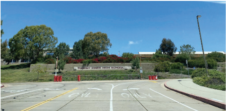
Experiencing actual high school in-person was such an interesting and new experience.

Many people will agree that this year was different from anything we had ever experienced in our lives, as students. It was overall the first year for every student to come back to in-person school from online school, but also the first year of school with the mask mandate. Many activities were limited, such as musical or athletic groups. Even through all of this, I would like to share my experience on how I went through this year and managed to survive such a weird