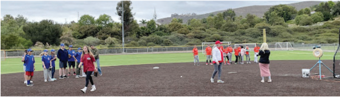
Both teams, the Astros and Cubs, lining up for certificates during their last game.

Certain organizations, such as NCL, the National Charity League for moms and daughters, the Lion Heart organization, and others, send students and parents with experience on the field to play, help, and teach Autistic students and adults. From warming up on the field to running from base to base, these helpers dedicate their time to making