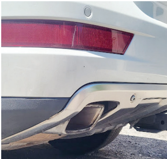
Even though we cannot see it with our bare eyes, cars emit great amounts CO2 into the atmosphere.