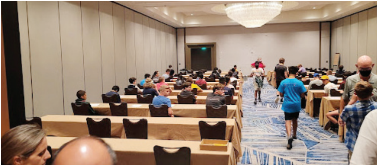
People filling into the ballroom to participate in the National Championships Exam

Headquartered in Burlington, Vermont, the International Academic Competitions, IAC, organizes team and individual competitions for elementary and middle school students. Their events are held worldwide, including in the United States, Asia, and Europe. The matches are based on subjects such as history, geography, science, and the humanities. They usually take a bee form, utilizing buzzers and point systems that take a competitor