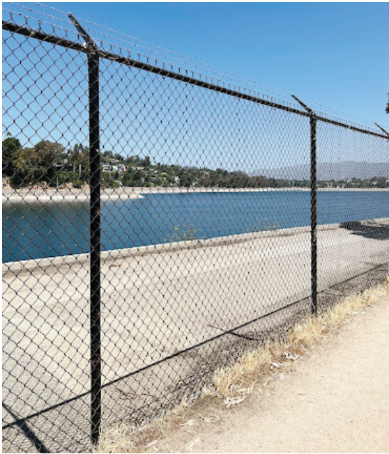
Walking around Silver Lake, in Los Angeles, is one of my favorite things to do for a break.