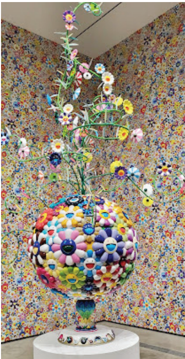
The 8-foot flower sculpture made of Murakami flowers is shown at the Takashi Murakami Artwork Exhibition.

Further in, hanging on the wall was the famous 82-foot wide painting, In the Land of the Dead, Stepping on the Tail of a Rainbow, a painting containing every emotion from sorrow, pain, ecstasy, and grief. Visitors stood in front of this wide painting, making their interpretations and seemingly trying to understand the very essence that Murakami poured into the painting. After various works of art, the pathway led back outside to the lobby of the Broad museum. Here, people bought the limited edition merchandise collaboration of the Broad and Murakami.