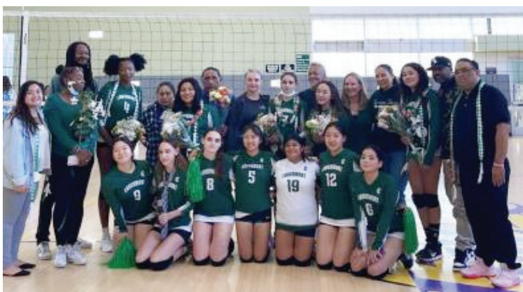
The Larchmont Charter Volleyball team photo was taken after winning the match.

Volleyball, a spring sport that involves a lot of team play, is not your average sport. It requires coordination of every player, with the main position being the setter, as this is your main source of offense. The positions include a