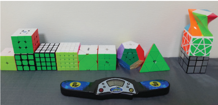
Different types of puzzles displayed at WCA (World Cubing Association) events (left) and three fun puzzles (right, stacked).

Cubing can encourage people. Many people can solve a 3-by-3 Rubik’s Cube blindfolded and in one hand. It might seem impossible at first; however, solving Rubik’s Cube blindfolded or with one hand is not hard. With much practice, it will be as easy as solving a 3-by-3 cube without a blindfold. Teaching other people how