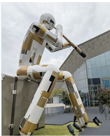
“Goethe” by Yong-baek Lee expresses a being on a suitcase, looking through a telescope into the unknown.

Paradise City Hotel, located in Incheon, Korea, is known for its many amenities, such as luxurious rooms, fine dining, a shopping plaza, swimming pools, a theme park, saunas and spas, and more. Nonetheless, another unrivaled fa-