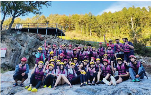
The group stops for a rest at one of the rocks for a photo.

Inje County is located inside Gangwon-do Province. The untouched nature in the mountains provides a bright color of autumn and a pastel-toned sky during sunset. My school, Juniper Christian School, went to Inje to learn about nature and fellowship. During the trip, the two critical fellowships were paintball and rafting.