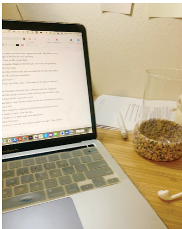
Be a part of NaNoWriMo this year and make your writing goals come true!

Sometimes, the most daunting part of writing is pulling up the blank page and starting from nothing. However, NaNoWriMo is a challenge that forces one to simply sit