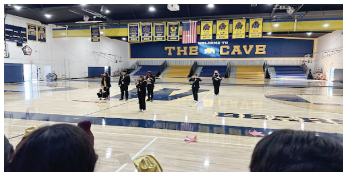
The Lieutenant Governors of Key Club Announcing the Winners of the Spirit Stick

Key Club is an international, student-led service organization that offers many opportunities, leadership positions, and service projects and is a great way to give back to your community. The Key Club's sacred oath is, "I pledge on my honor to uphold the objects of Key Club International; to build my home, school, and community; to serve my nation and World, and combat all forces which tend to undermine these institutions." There are approximately 266,000 international members and 36,000 members in California, Nevada, and Hawaii, for a total of 5,300 clubs in Key Club International present in 38 countries. All this information is provided at the Regional Training Conference. The purpose of RTC is to persuade members to try out for a leadership position, provide members with more details about leadership positions, and key clubs in general, but most