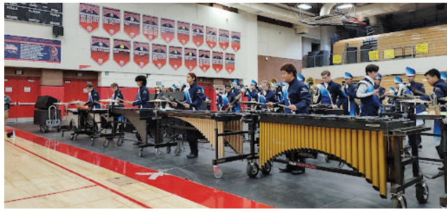
Crescenta Valley Marching Band performing their field show inside due to the heavy rain.

Nearly one-half of the school year has already passed. It is a journey and opportunity for everyone to try something and venture into new things. Marching band is one option students can take to make their high school experience special. Crescenta Valley High School has a hardworking, strong marching band. On October 15, 2022, in the midst of their competition season, Crescenta Valley Marching Band had their second band competition of the season, which took an unexpected turn.