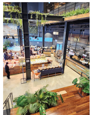
Casual cafe Myeongjang 10 is filled with both potted and hanging greenery and represents various choices in baked goods.