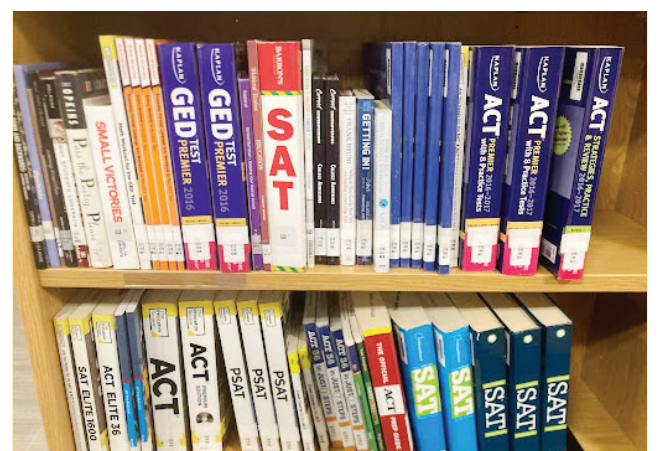
At my school library, there is a variety of donated standardized test books in many editions.

How can we combat growing book prices? Looking for somewhat older editions of books on the internet is one approach to saving money. An SAT test prep book published in 2017 will be no better or worse than one published in 2022. The content stays identical; they have simply added different practice exams and external resources. In my Calculus class at Ed W. Clark High School, for example, we use a textbook from 2008. Another option is to share or trade your books. I used this method for my AP classes last year because I had finished my computer science class, and my friend had finished their biology class. If you don't have any books to swap or money to spend, head