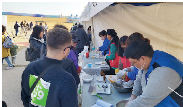
People volunteered and picked up ping pong balls that disabled players used in table tennis competitions.

Before volunteering, ask yourself the about the purpose. Why do you volunteer? Knowing the purpose is very important. Many people might misunderstand the concept and harm other people rather than help them. These days, many people volunteer just to earn respect for their time and use it to their advan-