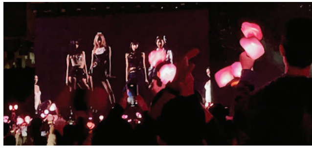
Blackpink's Legendary Entry to Ddu-du-Ddu-du as the crowd goes wild.

Grade 8 Santa Fe Christian Middle School