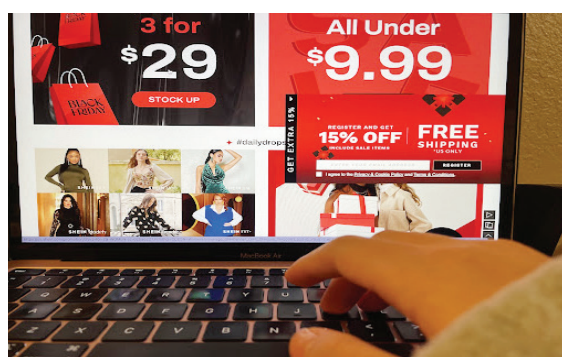
Fast fashion online is virtually always marketed alongside tempting deals and sales to persuade consumers to buy their products.

Back in middle school, I started noticing how other students around me dressed.