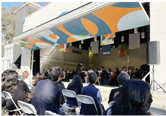
The audience's view of the orchestra that played at the beginning of the Los Angeles Choir Festival.

Ever since the outbreak of the Covid-19 Virus, Asian hate crimes in the US have skyrocketed. Because of this, the musical community of Los Angeles gathered together to raise awareness and support for the AAPI community at the Los Angeles Choir Festival, which was hosted at the Ezralow Family Outdoor Pavilion at the Heart of Los Angeles on