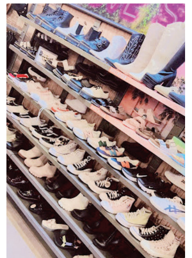
Racks at local clothing stores display shoes with high soles (the most reappearing brand being Converse).

If the long-lasting popularity of these lines tells us anything about