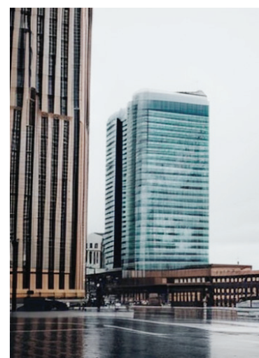
While obstacles may seem insurmountable, like towering skyscrapers in a bustling city, they can actually be used as fuel for our determination.

"When life hands you lemons, make lemonade." The same can be said with obstacles. Obstacles are a natural part of life, and they can be frustrating and difficult to overcome. However, they can also be an opportunity to learn, grow, and become stronger. When you face an obstacle, it's important to remember that it is only temporary and that you have the strength and determination to rise above it. It may be helpful to try to reframe your perspective and see the ob-