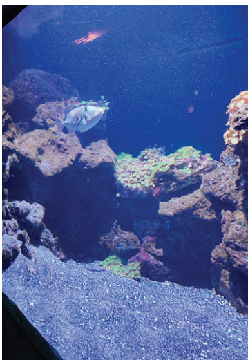
The Vancouver Aquarium is an amazing place to visit if you ever find yourself in Canada.