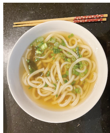
A delicious bowl of Udon noodles, which originated from Japan.

started to gain popularity: pasta. Despite the false common belief that Marco Polo brought pasta to Italy, Italians have been eating and enjoying pasta since 1138, long before Marco Polo was born. Eventually, as people developed better and tastier pasta, the markets in Naples, Italy, overflowed with a variety of types. These new kinds of pasta came in all kinds of different sizes, with a selection of different nuts, herbs, butter, and cheese to top them. It is quite evident that noodles were important in Italy, but how about in other parts of the world? Let's head over to a couple of hundred years ago in Japan, 1947. A Japanese inventor named Momofuku Ando dreamed of creating noodles that were both cheap, quick to cook, and delicious at the same time. Ando spent the next year attempting to create his idea and finally succeeded when he realized