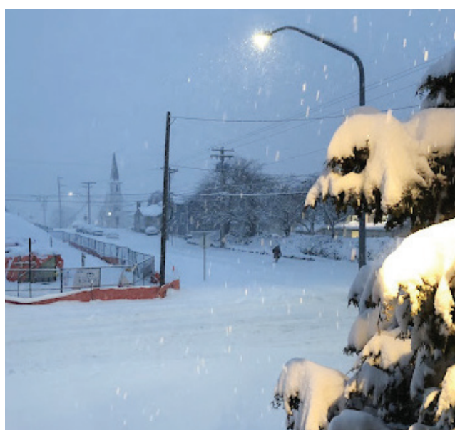
While it has been pretty warm in Los Angeles, it is freezing cold in Bellingham, Washington, which can lead to a cancellation of flights.

As the year 2023 approached, people traveled overseas or from state to state to see their loved ones. While people who live in relatively warm regions of the country have the option to travel by airplane, it has been a challenge for the ones who live in colder states, since