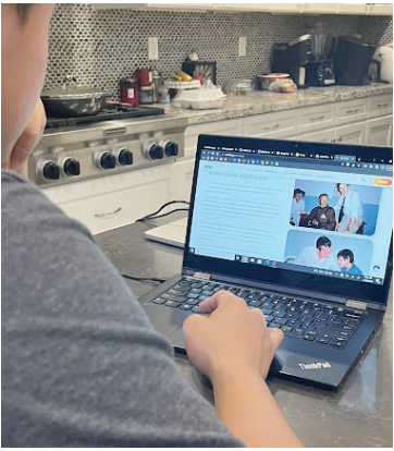
Watching YouTube videos can be educational rather than just for entertainment, as seen in some with MrBeast.

Millions of people have heard of Jimmy Donaldson, better known as MrBeast, who is known for his massive 131 million subscribers and incredible philanthropy on YouTube. On January 28, 2023, MrBeast released arguably his best video yet: “1,000 Blind People See For The First Time.” In this eight-minute video, MrBeast cured 1,000 blind people across the world by paying for their ex-