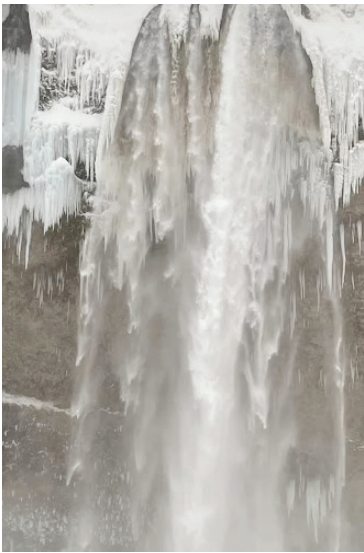
Waterfalls and natural structures encased in Finland’s freezing temperature. [Source: Audrey Park, Author].

More often than not, individuals travel within the boundaries of their country when given the opportunity. Although convenience has made this the case for some, people have also favored visiting other countries. When this topic comes to one’s mind, Europe is a prominent option for