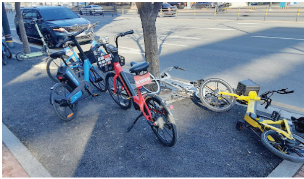
Share electric bicycles creating a mess on the sidewalk.

Some irresponsible customers park their vehicles on crowded sidewalks. This causes an inconvenience for pedestrians and for people who use the services to get from one place to another. Some other dangers are the speed and the battery pack. The law passed by the South Korean government restricts the speed of the vehicle to less than 25 km per hour. However, the speed of the vehicle can be