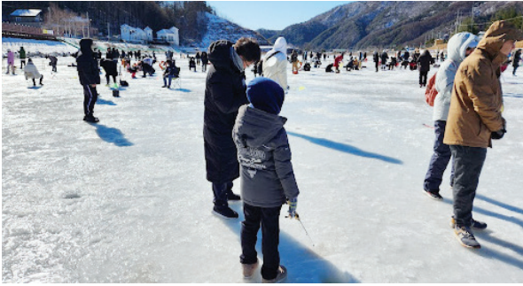
Through drilled holes in the frozen water, fishers awaited patiently for an amazing reward, Pyeongchang-gun’s succulent rainbow trout.

After three years of being out of business due to COVID-19, the Pyeongchang Trout Festival finally returned, in Pyeongchang, Gangwon-do, South Korea. 2023’s Pyeongchang Trout Festival lasted from December 30th to January 29th, approximately a month. Plenty of programs and events were established for all ages, centering on their theme of enjoying the frosty winter season.