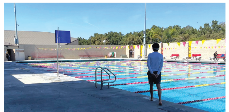
Woodbridge Warriors continue to train hard in and out of the pool.