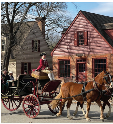
A horse-drawn carriage rides through Williamsburg

For one full week, La Canada High School's 8th-grade class had the unforgettable experience of traveling to Washington D.C. Although the trip was filled with ups and downs, each student definitely brought home some special memories. From visiting the United States capitol to petting horses at Williamsburg, every student had a favorite place that left a strong impression.