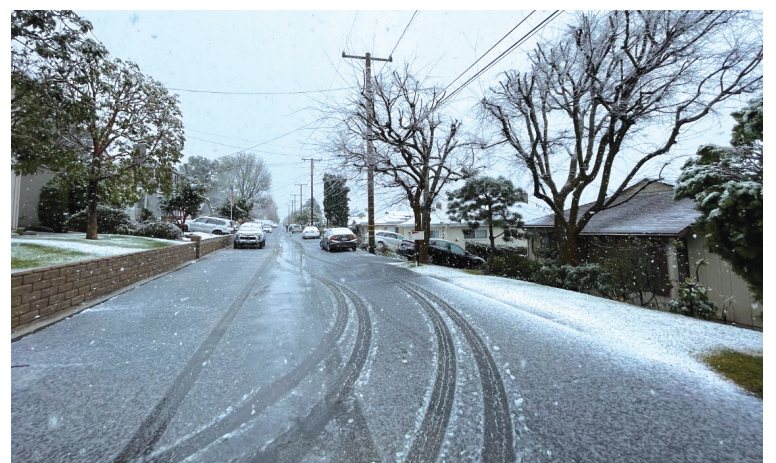
La Crescenta experiences snow for the first time in decades.

In La Crescenta, there was a lot of rainfall building over the course of a few weeks. Every day seemed to be colder than the day before, and the period of cold seemed to be everlasting. February 25, 2023, had felt like a typical Saturday. It was a normal, gloomy day, and like the other days, it was raining. However, different from the days before, this time, the rainfall turned into hail. Then, ever so slowly, powder-white snow started falling from the sky. Eventually, millions of little snowflakes started raining down in the upper part of La Crescenta. Toddlers started running around outside, yelping in joy, and residents started capturing many videos and photos to share with their friends and relatives, as this amount of snowfall had only occurred in La Crescenta decades ago. Even despite seeing snow in other places, having it in my backyard seemed like a winter wonderland.