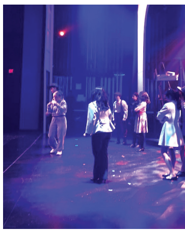
During the rehearsal for Willy Wonka, student actors received instructions on improving the gestures and dialogue for their scenes.

theater program has a general course for educating students interested in performing arts and a course that is directly involved with creating upcoming musicals. Due to its time consumption, the events of the second course are offered after school and begin with distributing roles to the ap-