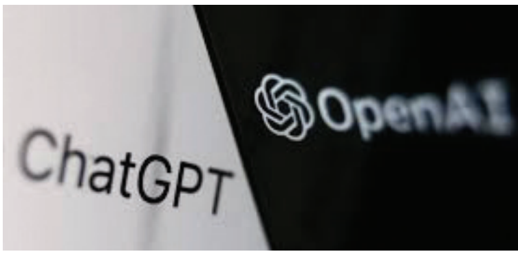
ChatGTP is taking over, but is that a good or bad thing?

ChatGTP, a newly created chat-box developed by OpenAI, has been taking the U.S. by storm. This artificial intelligence “is a transformer-based neural network that provides answers and data with human writing patterns,” states entrepreneur.com. It has over 175 billion parameters, making it one of the largest language models ever, and responds in real-time. Additionally, cnet.com states that “the bot remembers the thread of [an individual’s] dialogue, using previous questions and answers to inform its