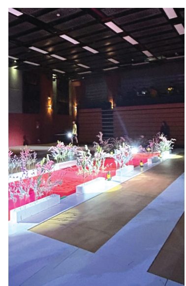
The fashion show red carpet stage for the models to walk

Vertices Vietnam provides a variety of Financial Supporting Services, including Company Reports, Industry Reports, M&A Supporting Services, Collection Services, and B2B Data Support. They help company reports of various types by gathering,