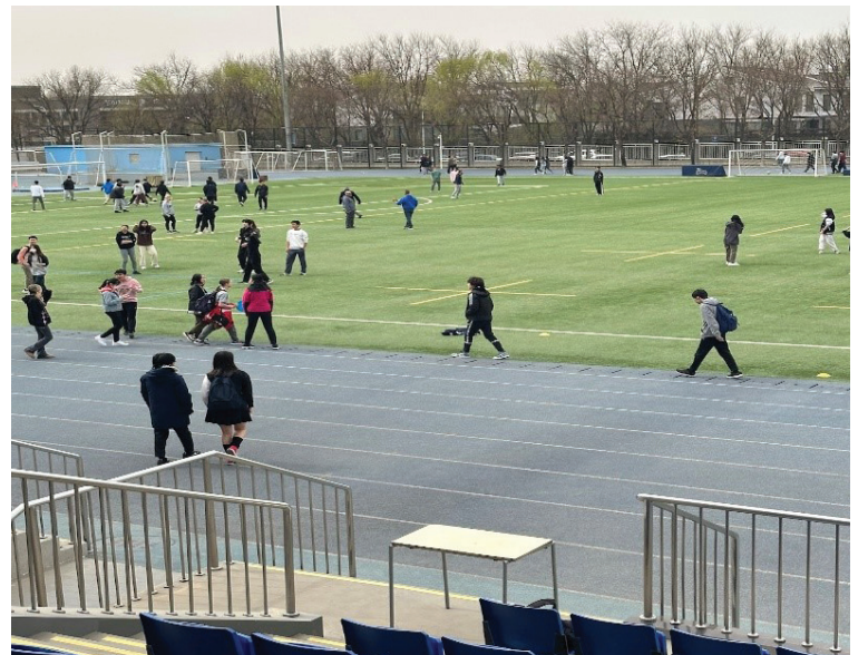
A lot of students play soccer whenever there is some time left after their studies.

It is important to actively participate in sports when you can because there is limited time for students to enjoy these activities with heavy class loads. As stated above, high school students lack time, as they spend all of their time barely finishing homework. Furthermore, there are some cases where high school students do not have P.E. classes or only attend health units (without ex-