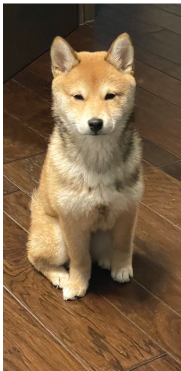
The Shiba is a great dog, with its cute fox-like appearance.