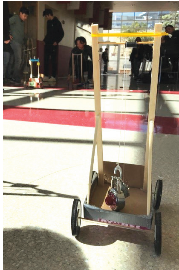
A few minutes before I used my first chance to test my cart

When we were first assigned this project, we were given the choice of