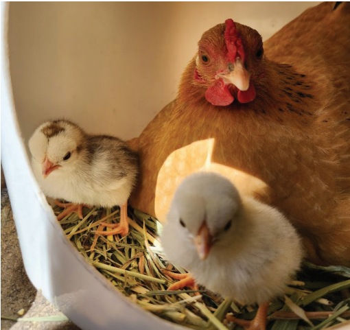
The new Easter Chicks and their mother!

birth to healthy chicks. On the day of Easter, after hearing the tiny chirping, I lifted Sunflower and found a pair of tiny, golden feet sitting under her. Instantly, I knew that a chick had been born. It was a miracle that the baby had survived. In the past, some of them had passed away from parasites or disease. When a chick is still in its egg, but ready to hatch, it will chirp, calling out to its mother. The hen will start to peck at the egg to help the baby get out. In order for the chick to survive, it is important to let it warm up under its mother for a few hours. When the chick first comes out, it is usually a bit slimy or wet and doesn’t have many feathers. After just a few hours of warming up, though, the chicks will start to grow tiny