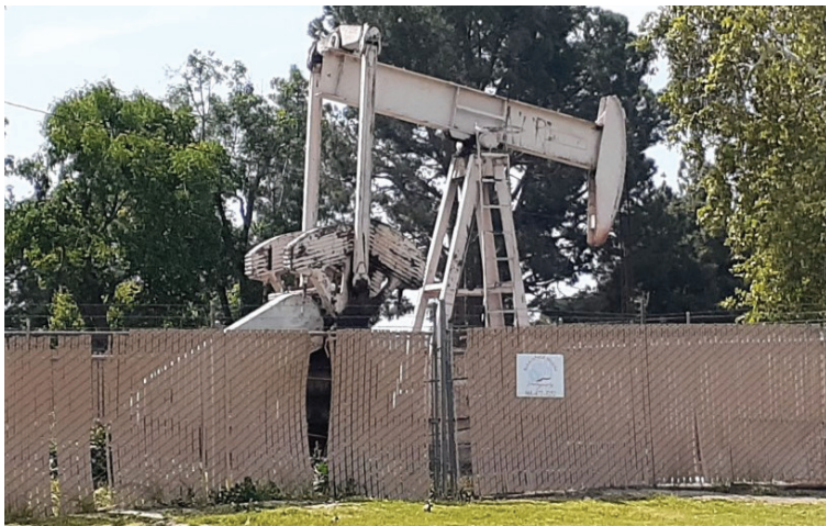
Bakersfield oil pumpjack is a staple in the city. [Source; Author, Ethan Chang]

The area that became the foundation for Bakersfield was originally inhabited by the Yowlumne native peoples who had once lived along the branches of the Kern River Delta. In 1776, Spanish missionary Francisco Garcés became the first European to explore the region, cataloging the general environment and isolation of the area. The Yowlumne were largely left alone until further contact was made with Mexican settlers following the discovery of gold in California in 1848. The discovery of gold in 1851 and the discovery