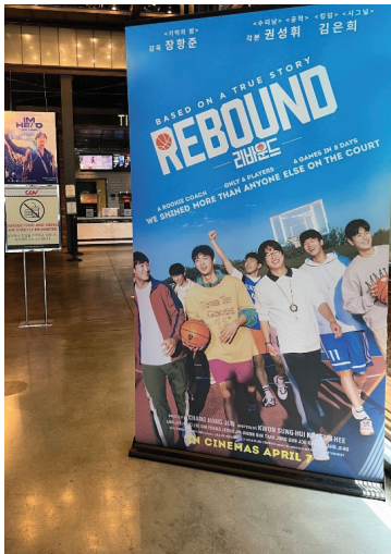
Rebound is an entertaining basketball movie based on a true story.

Released in CGV Theaters on April 5, “Rebound” is a highly recommended film for all, whether they enjoy sports or not. The movie entertains, stirs, and emboldens viewers, instilling a sense of passion and an inspiration to follow