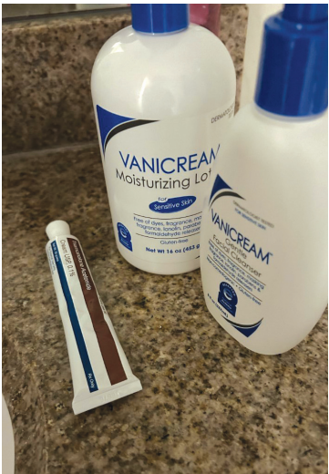
Steroid cream, moisturizer, and cleansers are all part of my skincare routine

A number of things about my face seemed wrong today. The scaly patch of skin between my eyebrows was now an angry red. Weeks of applying topical cream and moisturizer to combat my eczematous skin had only created more problems, like the fresh pimples that now surfaced on my face