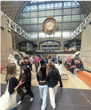
The Museum of d’Orsay and its famous clock.

In addition, the most noteworthy paintings, sculptures, and works of art are located in the center city of Paris. The Musée d’Orsay contains much Impressionism, Pastels, and