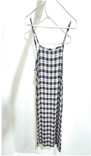
A dress from the fast fashion brand Shien is cute and trendy but has negative impacts on our environment.

Fast fashion requires the use of mass amounts of water, energy, and usage of non-renewable resources at an alarming rate. The fashion industry ranks 2nd in the consumer industry of water, as it