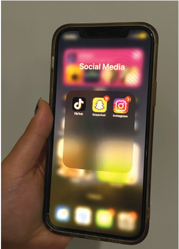
Social media is a big influence on an individual's insecurities.

Oftentimes, it's easy to want to blend into the crowd and resist the fact that what you see as your flaws are a part of your identity. From a young age, children are taught to express themselves in a way that makes them feel unique and comfortable in their own skin. They wear patterned leggings simply