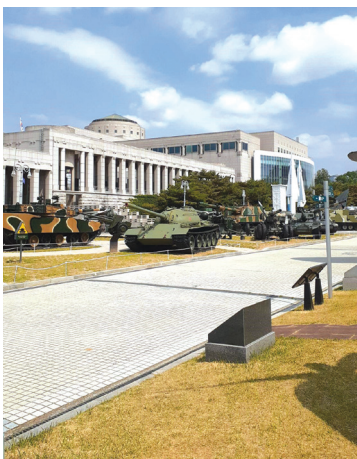
Collection of antique Korean War equipment at the War Memorial of Korea Museum, Seoul.

This largely passive role played by the ROK military changed with the outbreak of the Korean War on June 25, 1950. The northern invasion of the south exposed the weaknesses of the ROK military, being ill-equipped with hand-me-down U.S. weapons and general unpreparedness for open conflict. By the time an armistice was established to prevent further conflict, the ROK military suffered a total