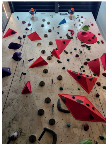
Bouldering focuses on both a climber's mental and physical abilities, regardless of the scope.

A sense of accomplishment is one thing almost anyone would enjoy. The more you go through to achieve the goal, the greater you feel. Rock climbing is one extreme sport that enhances your confidence with stimulus. With