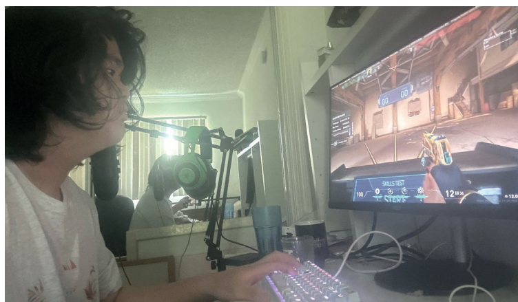
Many enjoy playing and practicing their skills while awaiting the upcoming Esport Valorant Championships, which they look forward to watching this August.

VCT, otherwise known as Valorant Champions Tour, is a competition known globally, where Valorant teams will face off against one another for the title of