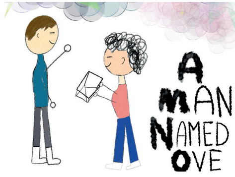
A Man Called Otto is an impressive film that is not only a great movie, but one which teaches kindness to all.

A Man Called Otto. Its views skyrocketed from the day it came out on Netflix, and, in my opinion, it is definitely one of the most heart-warming movies ever released. It is because of this I encourage you to make this movie a part of your life.