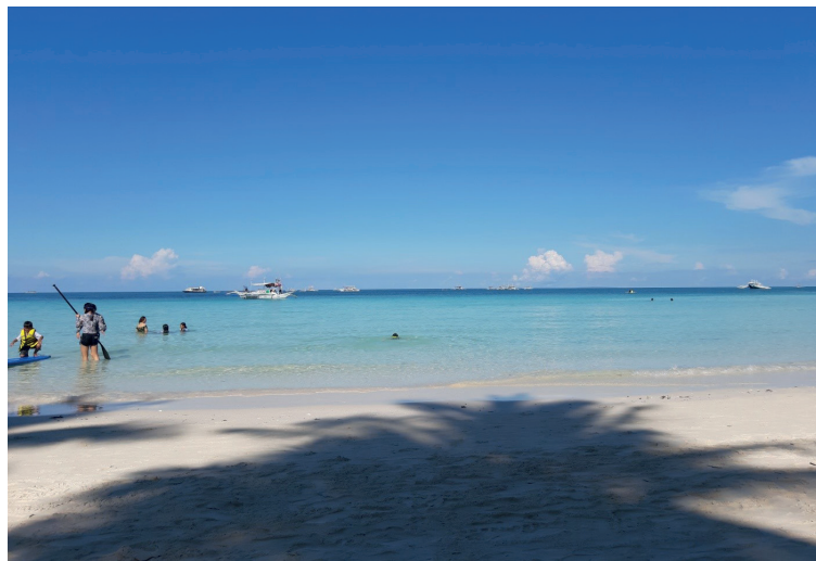
Families can be seen going to Boracay ocean as a family trip on summer vacation.

Vacation can affect students in various ways. How can they spend their vacation and have a meaningful time? A meaningful vacation might mean improvement in academic work. However, it can also mean other things. Focusing and putting all the energy into one's interest and improving skills, such as in certain sports or instruments, can have a positive impact on self-encouragement by achieving an ultimate goal. Planning for the vacation and having a solid goal to achieve is important as well; using half of the vacation