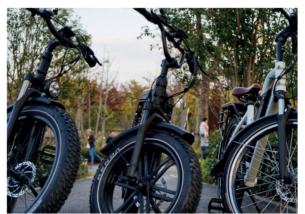
E-Bikes feature the simplicity that comes with controlling a run-of-the-mill scooter and speeds that resemble faster vehicles.

Furthermore, modern society has also seen the effects of the E-Bike in school and civic life. For example, many of these E-Bikes have been spotted in my city's streets, as it has nearly taken over the bike racks at schools, malls, and other public spaces. These were one of many factors that alluded to the E-Bike's significance in the urban lifestyle, as it illustrated the many young employees riding the vehicles to their job sites and teens enriching the quality of their meetings through faster transportation.