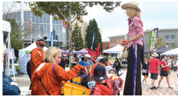
People are enjoying the Suwanee Festival while watching entertainers.

The Suwanee Festival is one of the largest festivals. It is held every year in Suwanee Town Center Park, Georgia. This year, it was held on September 16th and 17th. Countless people came to enjoy the festival with their closest families and friends. I was fortunate enough to be able to volunteer at such a large event. So, if you haven't already, you must check out this unforgettable experience for next year!