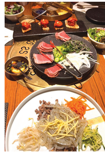
A visit to a relatively quaint, Asian restaurant presented diners with a delicious, cultural array of foods.

A clear-cut focus on integrating culture into their menu is the best marker of how an underrated restaurant maintains a steady flow of customers and navigates through competition. Culture-based cuisine is a business that is niche enough to have dedicated demand but limited competition, resulting in small restaurants in cities being a landmark for certain communities. To put this point into perspective, a city's East Asian community may enjoy Hot Pot, Sweet Pork, and Char Siu under dimlights but think that the experience of Empanadillas, Tamales, and Mole in a similarly decorated, Latin restaurant is foreign, and vice versa. Therefore, the remote popularity of these hidden