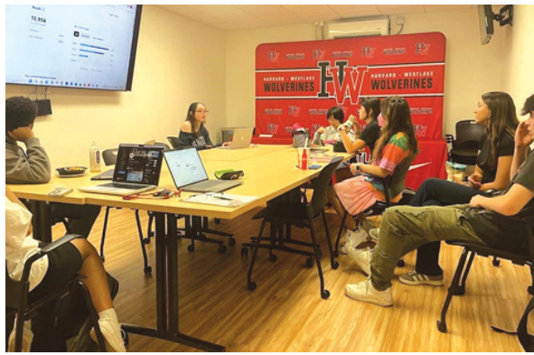
Members meet in the Taper Conference Room every Thursday from 11:00-11:30 AM.

Calling all teens! What sounds more fun, being able to attend all games while posting live score updates to your school's athletics social media page or, well, not doing so? I would say that the first choice sounds more appealing. So, that's exactly what I did this year during my first year at the Upper campus at Harvard-Westlake School (HW).