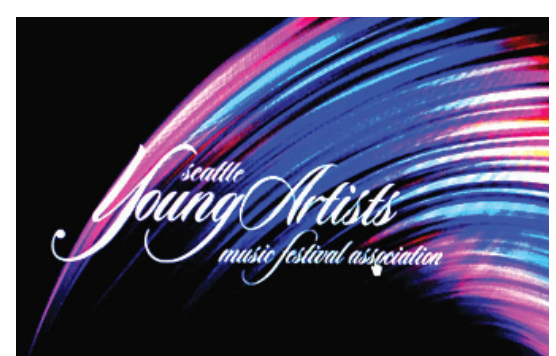
Official program cover of the Seattle Young Artists Music Festival Association.

With the fierce competition of other pianists and strong doubt, receiving an award opens many future pathways I envision for myself in music. My relationship with the piano has always been a struggle, but it's all worth it in the end.