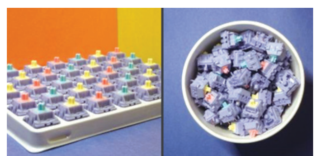
Switches come in a variety of colors, but they also can feel different!

As a mechanical keyboard connoisseur myself, I feel that mechanical keyboards have the ability to enchant and hypnotize an individual with psychological solace. Mechanical keyboards captivate many with visuals, auditory cues, and tactility. As such, keycaps often contribute to the pleasing visuals, as does the PCB with its RGB lighting, or the printed circuit board, casing the keyboard. In hand, a switch, consisting of a base, a spring, and a stem, can greatly personalize the volume and the "thockiness" of each keypress. "Thock," a word in the mechanical keyboard nomenclature, used to define a deeper sound signature, can often make or break a keyboard, based on each individual. In conjunction, the degree of