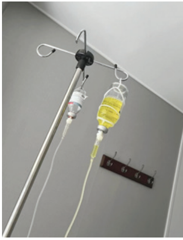
To cure Influenza disease, many people tend to get an IV to help speed their recovery.

Grade 10 International School of Beijing