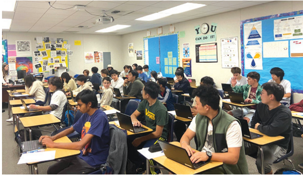
The AMC taking place at West Ranch High School.

Technology is becoming a vital part of our everyday lives. Everywhere we go, we are exposed to the wonders that electronic devices bring us. Behind all of this madness lies the basics of computer science, and even more fundamental than that are the dreaded principles of numbers and computations. Many students in the world often struggle with math, intimidated by its complicated concepts and confusing problems. However, it is important to note that math can be extremely useful in many situations that are relevant to our society today, and because of this,