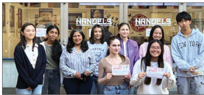
Portola High School’s Rotary Interact Club members collaborated with Handel’s Ice Cream to create a fundraising event.

Many high school students partake in community service events and volunteer at local centers to support those in their area. Some direct their love of animals and work at an animal shelter, while others use their teaching abilities to assist younger students with their homework. A unique organization, Rotary International, provides individuals of all ages the opportunity to participate in service events through the communion of leaders worldwide to promote peace and equity. Rotary International has created an opportunity for the youth to start their own clubs in their schools and district areas for students to develop leadership skills. At Portola High School, a dedicated group of juniors stepped up in order to start a chapter of Rotary Interact and