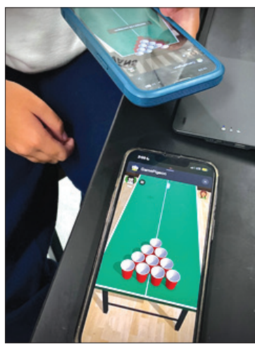
GamePigeon enables friendly competition between players through strategic scrimmages or coordination-based games.

Once the app is opened, a menu with numerous minigames will