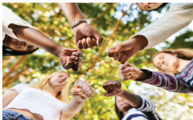
Learning about the different types of biases can help us from continuing to have them in the future.

You've heard of the word "equity," but do you really know the difference between equity and equality? You probably didn't dive into it too deeply, maybe thinking it's the same meaning as equality. What if I told you equity is the opposite of equality? What if I told you the word is important enough that a school district made a dedicated policy and club based on it?