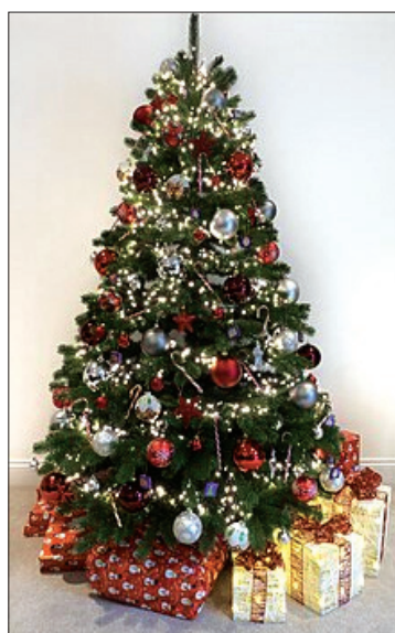
A Christmas tree can be decorated with baubles, Christmas lights, and ornaments. Gifts can be placed underneath, an insignia of festivity!

From a traditional aspect, the Gregorian Calendar, or the modern calendar, has December, the month that officially ends the year, followed by January, symbolizing new beginnings. The winter sol-