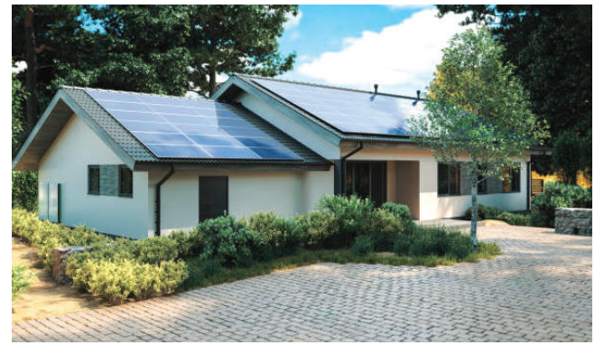
Many homes in California can be seen with solar panels, helping to reduce the use of fossil fuels.

one of the largest solar facilities in the world for its time. Actions towards supporting solar energy increased in the mid-2010s, with the construction of the 550 MW Topaz Solar Farm and the Desert Sunlight Solar Farm in 2014. A year later, the 579 MW Solar Star facility went into operation. All three solar facilities mentioned were considered three of the largest photovoltaic solar facilities in the world, skyrocketing California's solar energy usage and the growth of solar-based companies like First Solar. This effort for solarization was further supported, with California leading the U.S. with the Million Solar Roof Initiative, a plan that resulted in the installation of over 230,000 solar panels on the roofs of Californian citizens. In December 2017, the California Public Utilities Commission approved allocating one billion dollars to incentivize owners of