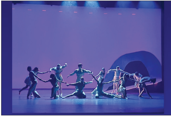
Dance Production Brings Concepts of Infinity to Life.

Dancers quickly set up for various positions on stage. All are nervously waiting for their big musical performance. Hours of rehearsals, lots of sweat and sacrifice all culminate in a great show. From the moment when our teacher announced, "This year's theme for the showcase ... " the exhilaration of all the students filled up the room. Everyone's hearts were racing so fast, with no one able to focus on anything except for the theme: "... is infinity."