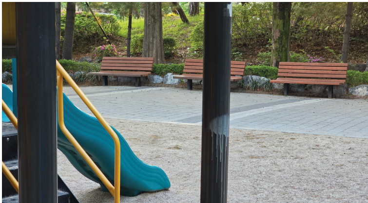
The playground is barren; missing are children on the slide and parents on the bench.

The decline in birth rate is not limited to South Korea, as most of The Organization for Economic Cooperation and Development (OECD) countries are experiencing a decline in population. All of the OECD countries have a total fertility rate below 2.1, except for Israel with a rate of 3.0 children per woman. Until recently, China has taken the lead for the most populated country on earth, however, it