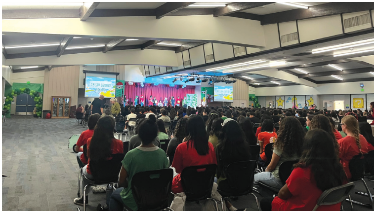
A Junior High assembly room all decked out for a Super Mario Bros-themed rally!

The Renaissance program is a nationwide program that recognizes and rewards students for academic excellence and behavior. Schools involved with the Renaissance program put on events or do other activities for school communities to feel seen, not only for students but also for the staff! One of the ways the program fulfills its purpose is for schools to hold rallies. Although there may be discrepancies in junior high and high school, the events hosted usually