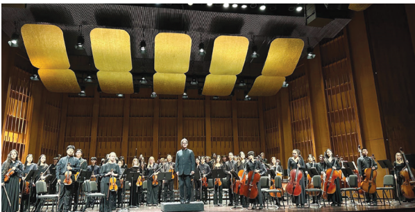
The Los Angeles Youth (Symphony) Orchestra, taking in the applause before a performance.