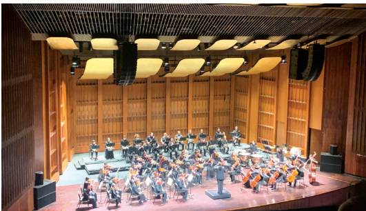
The Los Angeles Youth (Concert) Orchestra performing Bartok's Pieces for Children.

What’s that sound? Is it the cool breeze carrying ripe leaves through the sky? What about over there, in the distance? Do you see the bustling town streets behind the hill? Imagine arriving in a grand country for the first time, with beautiful scenery and fresh air accompanied by music that’s never been heard before! An orchestra coming together, a peaceful scene by the brook becomes a joyful gathering of townsfolk, when suddenly, a great thunderstorm strikes! It seems that all will be lost until... hear that? The birds are chirping