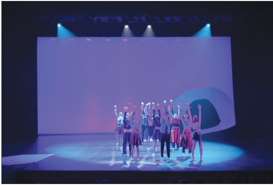
Interdependence, Dance About the Infinite Human Connection.