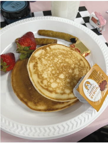
The 25th Annual Pancake Breakfast, held at the ATTIC Teen Center in Torrance, was a huge success!

On Saturday, April 13, Torrance residents gathered at the ATTIC Teen Center for a morning of pancakes and entertainment during the 25th Annual Pancake Breakfast. This cherished community event, held bright and early on a cool Saturday morning, brought together neighbors, families, and friends to support the ATTIC Teen Center while celebrating the immense talent of local middle and high school teens.