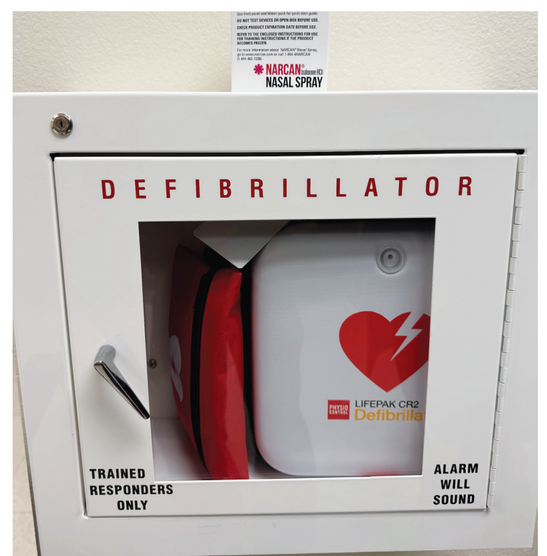
The medication Narcan at my school, The Science Academy STEM Magnet, is there in case of an overdose.