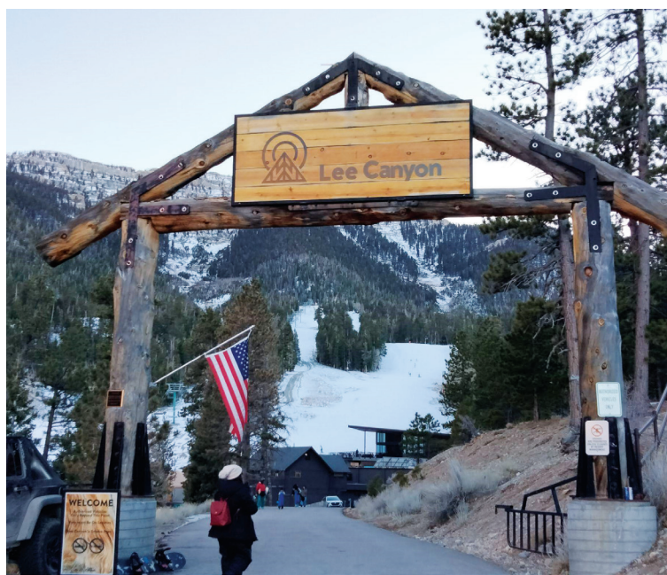
Lee Canyon's entrance, no matter how bare it may seem, is a welcome mat for skiers, snowboarders, and campers alike.

Lee Canyon is a mountain ski resort approximately an hour away from the Las Vegas strip where both residents and vacationers are able to enjoy skiing or snowboarding. This year, I went at the beginning of January to go snowboarding with my family—I also enjoyed the different amenities that this location had available for guests. The main attraction, however, was the slopes. There are twenty-seven different trails in all, available to riders, starting with the beginner-friendly Rabbit Peak trail all the way to the winding Slot Alley trail that experienced riders love. Some of these trails even have ramps, poles, and bumps so that