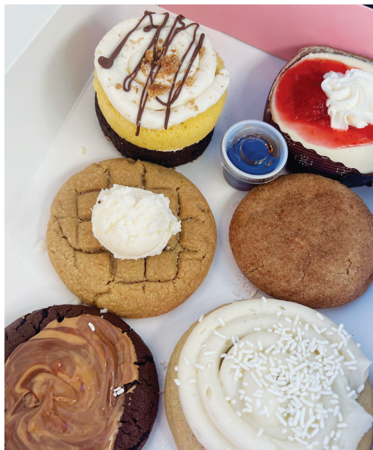
Although some may say that the cookies from Crumbl are overpriced, the size and flavor of them may be considered worth the price.

Advocates of the sweet delight at Sunny Hills High School cite the company's innovative