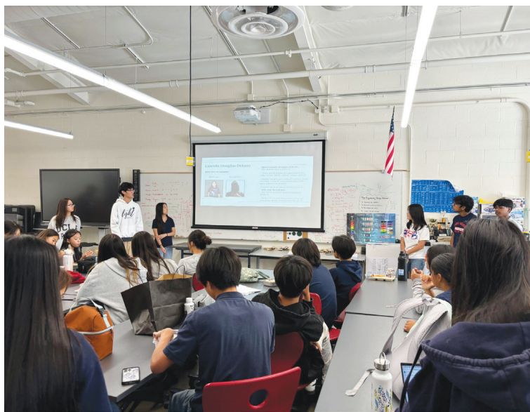
Oxford Academy holds bi-weekly Speech & Debate Club meetings where students can engage in various public speaking activities and compete in specific speech/debate events.

As studied in 2021 by NCBI, more than 61% of university students in the U.S. note a fear of speaking in public. Since public speaking has become prevalent in a variety of careers in society, it is essential to address this self-conflict that many encounter.