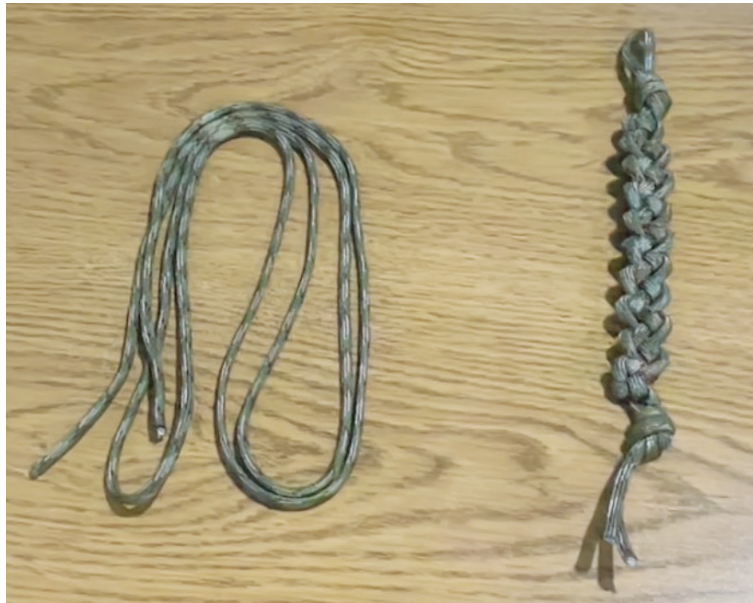
Before and after of a paracord lanyard for our service members and first responders crafted by a student.

If you love crafting and want to make a real difference in your community, why not put your talents to good use? I am currently working on two crafting projects: crocheting blankets for babies in the Neonatal Intensive Care Unit (NICU) and making paracord lan-