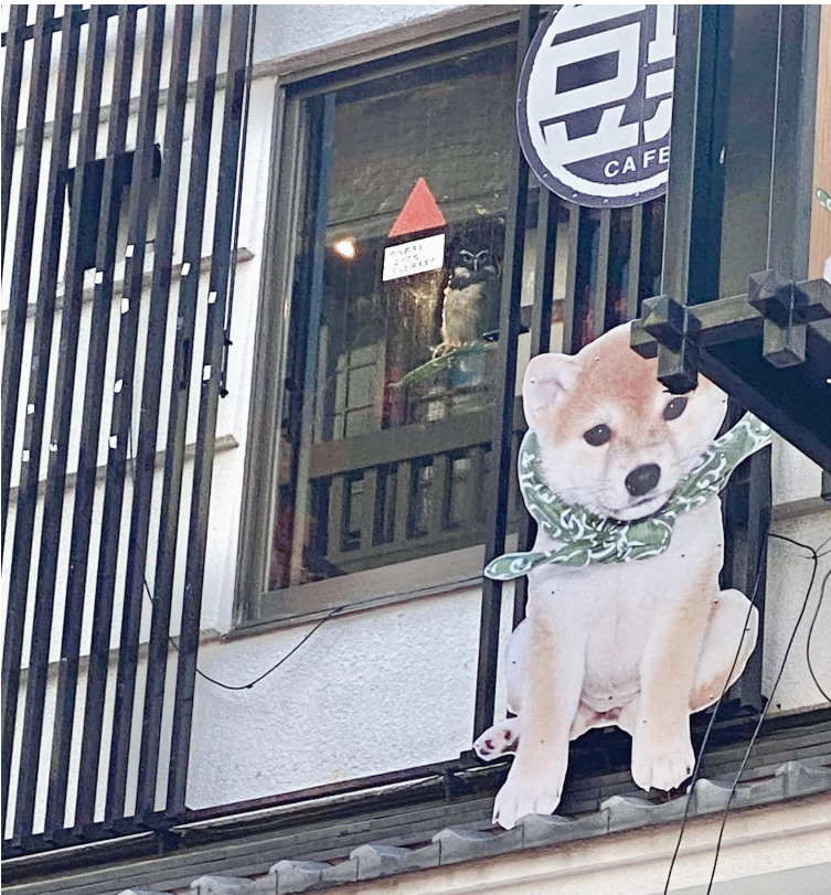
Although the Mameshiba Cafe and Owl's Forest in Osaka's Dotonbori district is a popular tourist attraction, is the animal welfare being considered.