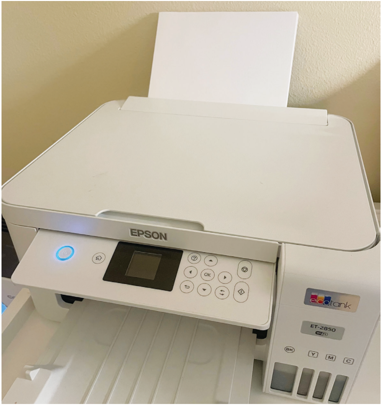
Paper is costly and a paperless office can be more effective as it greatly reduces the amount of storage and filing that will need to be done. [Source: Author, Chloe Je]

However, in practice, completely eliminating paper is a lot more challenging than it seems. Certain industries, such as legal, healthcare, and government, still rely heavily on paper due to privacy concerns, regulations, and just in terms of physical signatures and records. In some scenarios,