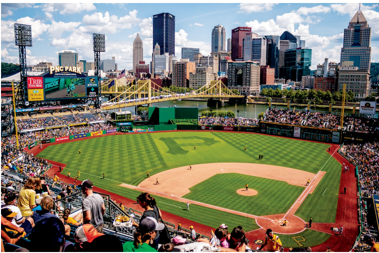
A sky view of the baseball stadium located in Pennsylvania filled with fans for the game.

In this 2025 season, many teams are contending for the World Series Title. Last year's World Series Champions, the Los Angeles Dodgers, had a hot start with an 8-game win streak. They currently have 10 wins and 4 losses, and are currently third in their division, with the San Francisco Giants at second with a record of 9 wins and 3 losses, and the San Diego Padres at first with 10 wins and 3 losses. It looks like there is going to be a clash for the Division Title in the National League West. Another team to look out for is