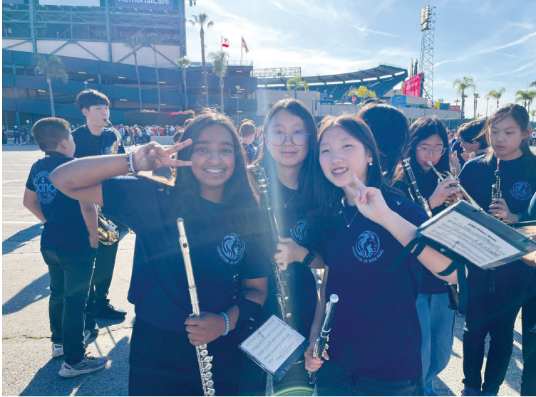
Lexington Junior High Band students prepared to perform the National Anthem at the Angel Stadium.

When it was finally time for us to play, all eight bands marched out into the brightly lit field, taking their position in front of thousands of baseball fans and spectators. As the conductor raised their hands, hundreds of instruments rose in unison. The National An-