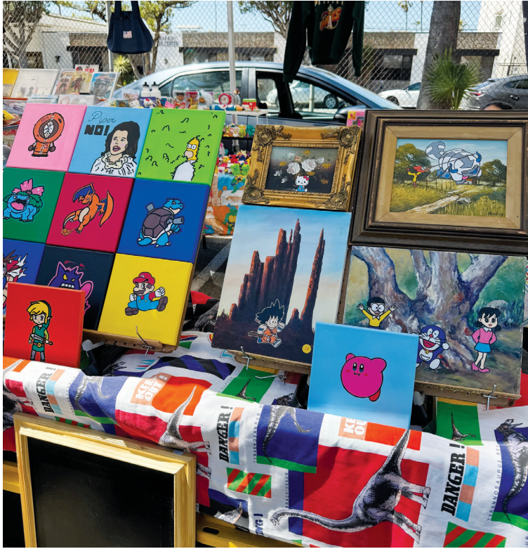
Vibrant artworks catch passersby’s attention and showcase the vendor’s artistry at the Melrose Trading Post.

Upon entering the Melrose Trading Post, I was entranced by the scene--several columns of booths lay before me, not one exactly like the other. Every booth tells a story, unique to each vendor’s experience, character, and interests. Stepping into one after another, I felt immersed in a new realm each time. I found myself circling the shops filled with cameras, vintage fashion items, and accessories. One in particular left me with both a cherishable memory and keepsake, allowing me to customize my own unique charm bracelet.