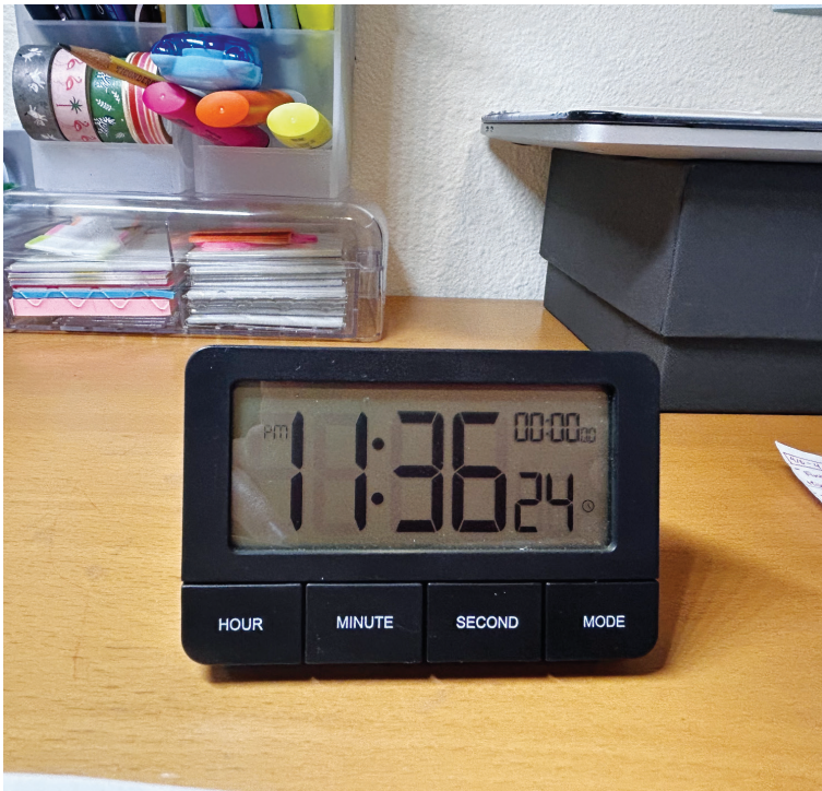
Utilizing a desk timer to keep track of tasks is beneficial for me to ensure I am using my time productively.

We’ve all experienced that well-known feeling after weeks of tests and projects: a break that seems to offer all the time in the world. We can binge our favorite shows, complete unfinished art pieces,