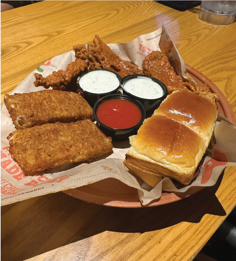
The Internet sensation Chili's Triple Dipper appetizer with fried mozzarella sticks, Nashville hot chicken crispers, and mini sliders.

mozzarella sticks, Nashville Hot chicken crispers, and mini sliders. The food took about 20 minutes to come, and it arrived piping hot. I immediately dove into the chick-