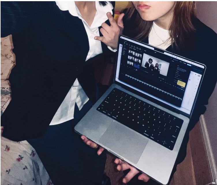
Slide Decks offering visual insight into a business often accompany digital pitches entered in Business Competitions.

When picking up a book, most readers instinctively look at the cover page to formulate a first impression. As the study of psychology has commonly found, the phrase “don’t judge a book by its cover” is not always held true, as humans are highly influenced by preconceptions due to Rapid Visual Information Processing