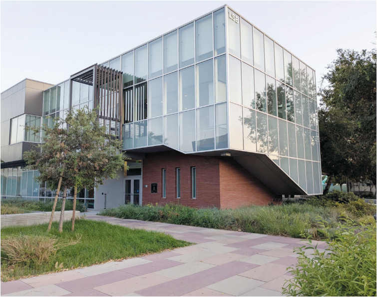
The Life Sciences Building at Irvine Valley College is just one of the many privileges available to students taking their dual enrollment courses. Taking the hundreds of courses available among various local colleges can change the academic career of countless students.

The dual enrollment programs, a source of education offered in various schools and colleges, are an excellent academic opportunity and a head start to a fantastic college career. Many students find themselves with extra time to spare for additional out-of-school activities, but are unsure or indecisive about how to approach new courses or opportunities. For such scholars, the dual enrollment program can be an excellent solution to their dilemma.