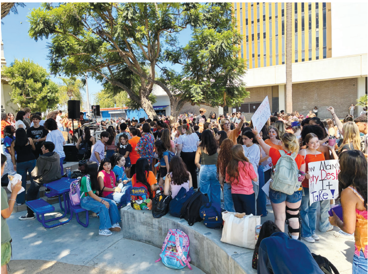
Students gather in front of the Orange County School of the Arts in orange clothing to support the national gun-violence awareness efforts.

In early September, students nationwide participated in a coordinated walkout to bring attention to the ongoing threat of gun violence in American schools. The action was planned by a coalition of student leaders and other organizations that advocate for student safety. The walkout was scheduled to happen at noon. Students filed out of classrooms to