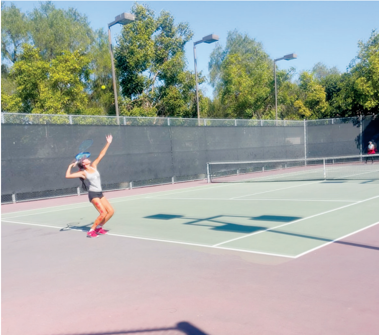
One of Ayala's Tennis Varsity girls playing a singles match during the Beckman Tournament.

Recently, the Ayala High School Girls' Tennis Team attended the Beckman Tournament, with both the Junior Varsity and Varsity teams of Ayala, Beckman, Redondo, and Woodbridge High School competing. The tournament brought together the four teams to compete, creating an exciting atmosphere. This opportunity allowed players a chance to put their skills to the test while also learning from their mistakes. Players were pushed to their full potential and were able to interact with other athletes and coaches. Overall, the tournament was about far more than just winning - it was about growth, sportsmanship, and making memories.