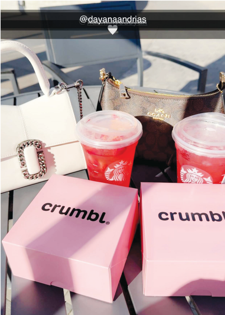
Starbucks and Crumbl with a friend: the perfect treat for fall.

Grade 10 The Science Academy of STEM Magnet