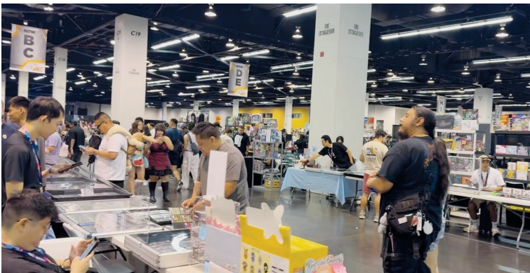
The vendor hall in Anime Impulse was a great place to find merchandise and get to know more about the K-pop culture.

In addition to Kplay Fest, you can also experience its sister events, Collectors Expo and Anime Impulse, at the same time. Whether you have the Kplay Fest ticket or the Collectors Expo ticket, every ticket gives access to the other events to encourage participation in each world. The Anaheim Convention Center was sectioned off between Kplay Fest, Anime Impulse, and Collectors