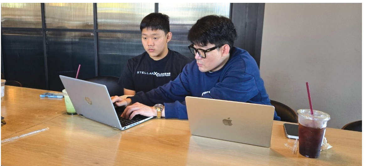
Counseling sessions outside of the classroom create lasting connections that help students with their struggles.

Parents I spoke with expressed similar feelings, stating