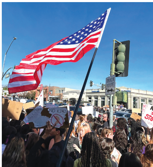
A participant of the walkout waves a large American flag, towering above their fellow protesters.

with nationwide issues. Though the structure of this walkout could have seemed chaotic, there were constant reminders and updates about the event, from meeting locations, times, poster ideas, and more. During lunch, right before the walkout began, students were scattered all around campus, making posters and preparing for the walkout.