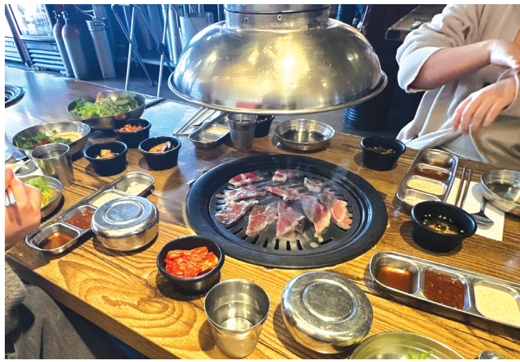
My friends and I enjoyed Korean BBQ in Koreatown, which was a great way to recharge and enjoy some time away from the stress of school and studies.

do during busy school days. We went to a Korean BBQ restaurant in Koreatown, California, where we ate all the meat and sides, filling our stomachs to the fullest. Afterward, we burned off our previous meal by walking to a shaved ice place nearby for dessert. We also spent a whole hour in a photo booth, snapping pic-