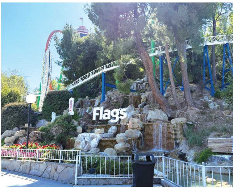
Six Flags Magic Mountain in Valencia, California, offers a fun experience and an opportunity to learn more about physics through its various thrilling rides.

During my time at the park, I rode on The Riddler's Revenge, The New Revolution, Ninja, Gold Rusher, Buccaneer, Jammin' Bumpers, and Swashbuckler. The Riddler's Revenge's unique structure made it my favorite ride of the night. It requires riders to stand during the ride, adding to the thrill and differentiating it from other roller coasters. However, I also enjoyed Jammin' Bumpers, which are bumper cars. It was even more fun since I did it with my friends and constantly bumped into them. The Magic Mover, a ride not meant for thrill-seeking purposes, exists for transportation purposes. This made my visit way more convenient as it provided transportation to the top and bottom regions of the park. Consequent-