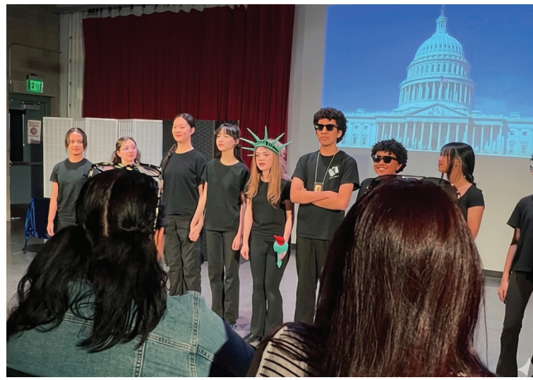
The Integrated Arts conservatory middle schoolers line up for applause during the second act of the Acting Moments show.

During the two nights of dress rehearsals, the excitement was high, since everyone was allowed to try on their costumes