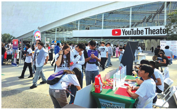
The 2026 StudentsBuild National Summit's HelloFuture expo took place at the YouTube Theater. Civicate Youth had a table to promote youth civic engagement, sports, and human rights awareness.

man rights awareness campaign in tandem with neighborhood council election information resources. I prepared a large tri-fold and red post-its for the campaign, where the goal was to have students write down harmful practices they've observed in sports, including bullying and discrimination. I hoped this would encourage them to think about how human rights and sports are closely connected. Post-campaign, I saw almost 100 responses containing distinct answers, showing me the diversity in answers we were able to collect.