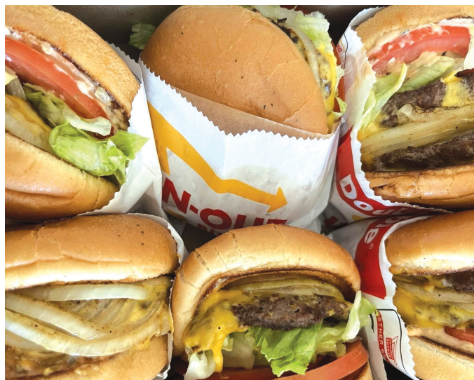
Boxed Perfection: Exploring how a limited menu and "fresh-never-frozen" philosophy continue to dominate the West Coast food scene.