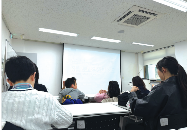
Members of the 2026 Seoul Youth Participation Committee gather for the first meeting of the year.

While the 2026 committee has only just begun, the program itself has a history of encouraging civic engagement among young people. In previous years, participants have addressed a wide range of issues, including education inequality, student mental health, and youth welfare. Most proposals have been sent to be