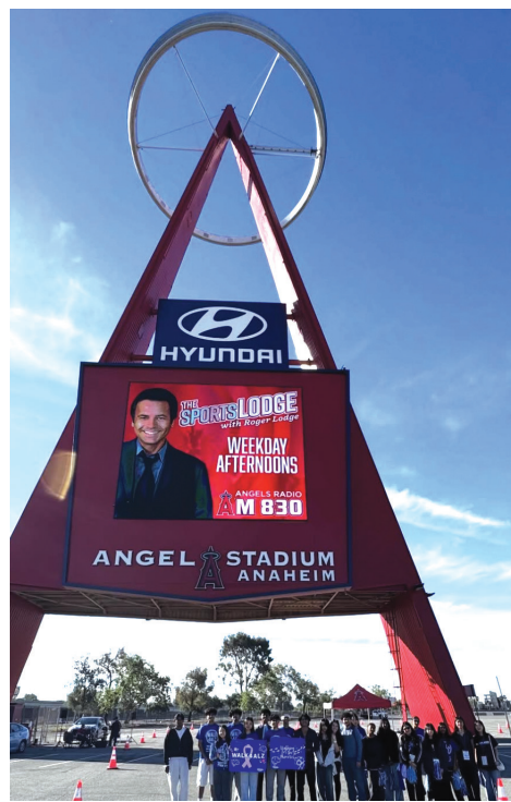
Lexington FBLA collaborates with Cypress High FBLA and HOSA to cheer on Alzheimer's Walk participants.

FBLA members arrived early in the morning, around 7:30