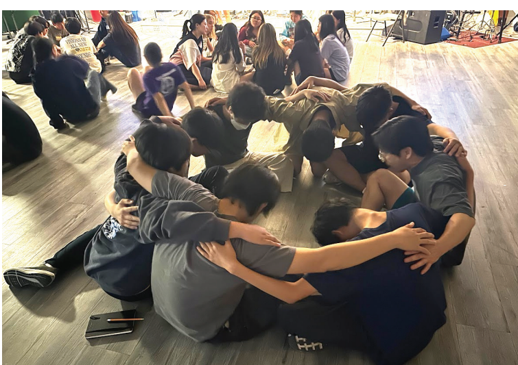
At Hanbit Church's most recent Middle School Praise Night, attendees felt a strong sense of fellowship and bonding, connecting more with each other.