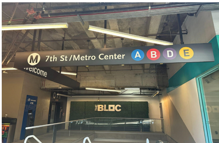
7th St/Metro Center Station, which serves as the busiest and major transport hub for traveling across Los Angeles.

For the past few years, Los Angeles has been expanding and modernizing its transportation networks through projects led by the Los Angeles County Metropolitan Transportation Authority. One key project is the extension of the rail lines, specifically the D Line subway, which will connect Downtown LA all the way to UCLA. They have also recently approved the K Line extension, which will allow riders to travel all the way from Torrance to the Hollywood Bowl, while passing the Los Angeles In-