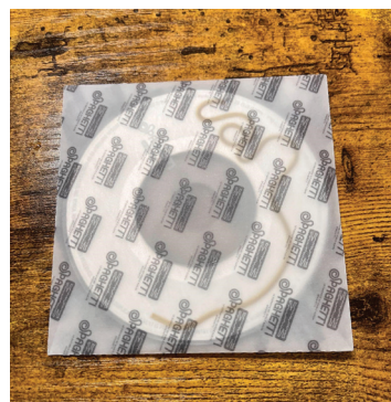
A Compact Disk (CD) that came with a modern album cover shows how analog culture is still present in the music industry today.

In an era of AI-generated so-called perfection, analog cul-