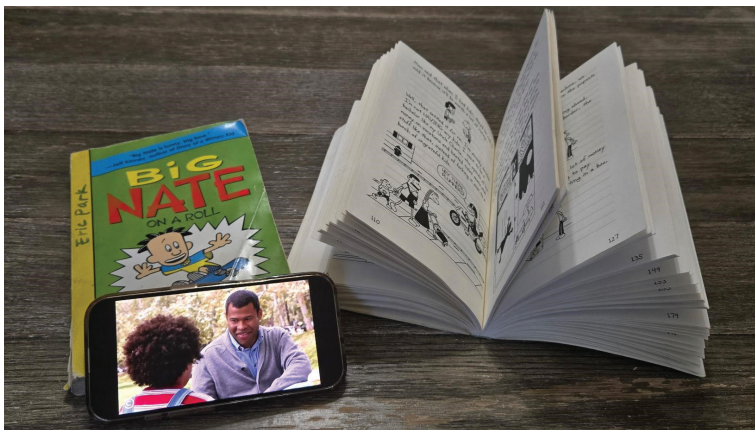
Modern entertainment from smartphones replaces traditional offline practices, proven to be more harmful than good.

After my classmates shared some thoughts about their phone habits, almost everyone admit-