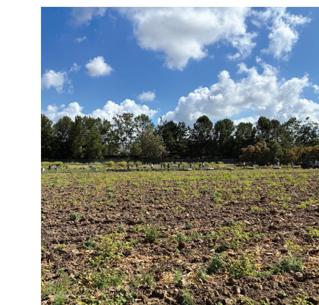
A large community farm overlooks a field of freshly turned-over soil: a place where many come to volunteer their time and help make the world a little better of a place.

Beyond just nutrition, local farms help the local economies. When people buy directly from farmers' markets or community-supported agriculture programs, more money stays within the community. This helps small farmers keep their businesses going, create jobs, and maintain the agricultural diversity. Without this support, many small farms can't really compete with large industrial operations, which can