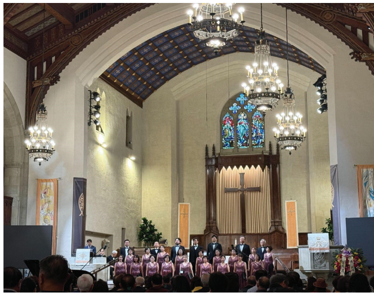
The Young Angels Choir performed as guest artists in the 8th Annual Benefit Concert.

The program featured 18 songs ranging from different genres, languages, and cultures. The program was impressively varied, moving from the traditional African American spiritual, "Ride the Chariot," to upbeat Korean pop songs that energized the crowd.