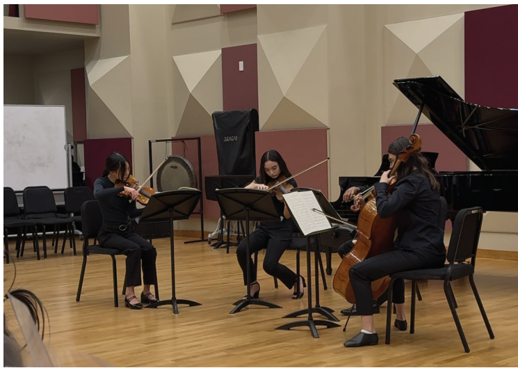
During the final performance at the Colburn Summer Chamber Intensive Program, my group played like we would have never imagined when we first started rehearsals earlier that week.

Entering the program, I anticipated an extremely fast-paced and rigorous environment since members were only given about a week to rehearse and perform. However, it was manageable because the schedule included frequent group rehearsal sessions. The program spanned from Tuesday through Sunday, with daily sessions ranging from five to six hours. Despite the tight schedule, the intensive included fun events like watching master classes, yoga sessions, and solo recitals.