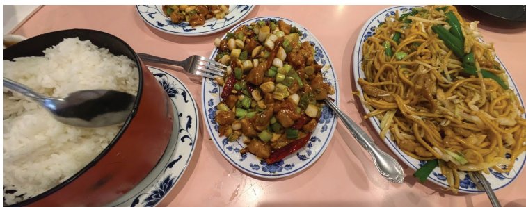
Seafood Town's generous portions and low prices keep diners coming back for more and creating new memories.

To be honest, Seafood Town's interior is not glamorous. The room is filled with a dim, flickering light that feels like a hazy fever dream. The old-fashioned telephone never stops ringing with takeout orders. The restaurant walls are pink — a fact that delighted me when I was a child — but now I see that the