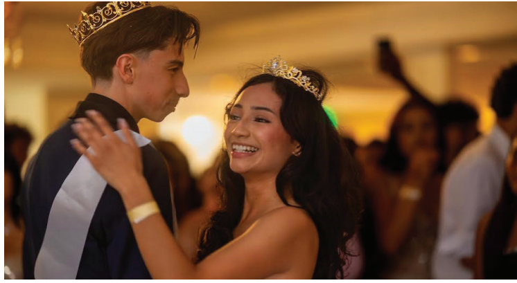
The prom king and queen enjoying their first dance on the dance floor at the Los Angeles Equestrian Center.

No matter how exciting, prom, of course, can't be prom without