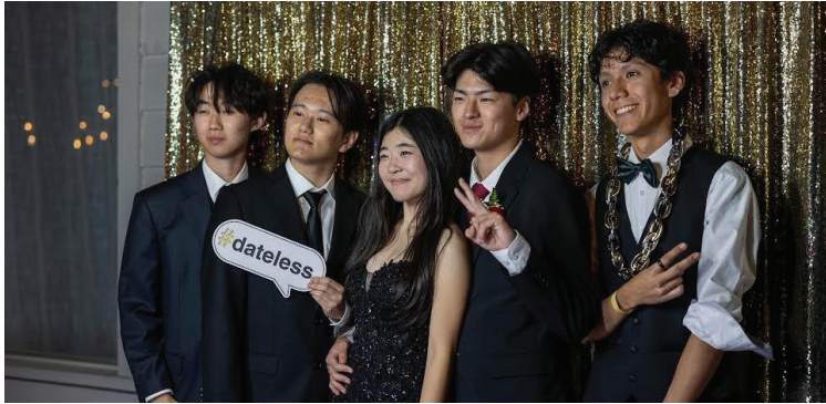
A group of friends posing for a picture at one of the many photobooths stationed at prom.

pictures. Photobooths were scattered around the venue with long lines of friends and dates eager to pose themselves against the flashy background of "A Night in