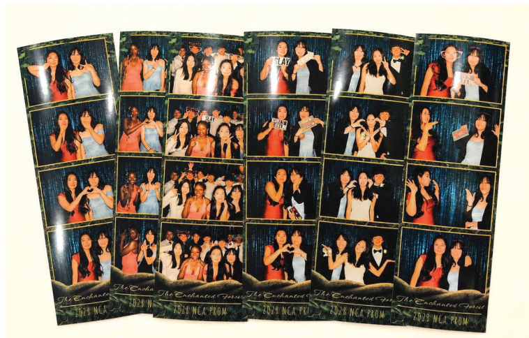
Along with a dance floor and raffles, the photo booth helped students create lasting memories at prom.

When students initially arrive, they must go through the check-in process, which is run by multiple members of the student council. Once they are checked in, they are free to look around, explore the venue, and greet friends. There was a decorated backdrop that they could take advantage of for pictures to commemorate