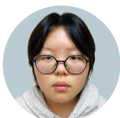
Yale Lee Grade 9 Science Academy STEM Magnet

Ever since the worldwide pandemic, the rise and influence of streaming services, such as Netflix and Spotify, have dictated how people consume media in the modern era. Instead of going to the theaters to watch the newest movie, audiences can now choose what to watch from a catalog of television shows and movies from the comfort of their homes. Likewise, physical media such as CDs and vinyls have been replaced by streaming services, which allow users to access millions of songs with a single tap on their phone. These rifts in the industry marked the death of the era of traditional media while bringing the rise of a new digital era of the entertainment industry.