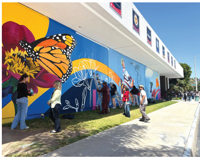
The giant mural at the center of the Orange County School of the Arts, painted by graduating students, reflects the school's creativity and dedication. [Source: Author, Ava Je]

Each mural is of a different design, celebrating the school and the many forms of art taught, including instrumental music, dance, and visual arts. Examples include the school's name written in bold colors, detailed underwater landscapes, and piano keys. They reflect the creativity and skill of all OCSA students, all while making the campus more unique. Moreover, since these murals have been