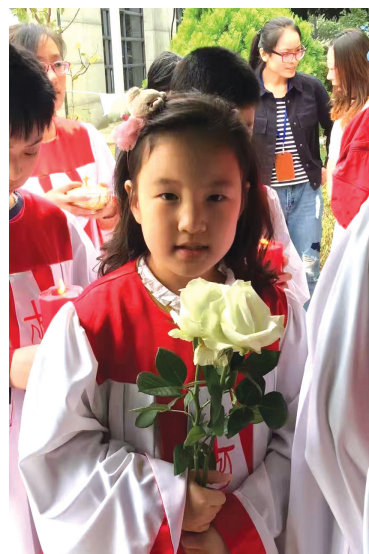
She did not know everything about the world yet, but she knew how to serve with joy and believe in herself steadfastly.

Since birth, I have always associated summer with freedom, joy, and energy. The small moments I once took for granted—walking into a convenience store and getting a vanilla-and-chocolate mixed-flavor ice cream shaped like a snowman—became valuable and irreplaceable. I can still clearly remember how zealous and content I was after taking the first bite of that ice cream and enjoying how the flavors mingled together as if they were dancing on my tongue. After all these years in high school, whenever I went back home, I earnestly searched for that same ice cream, but I never succeeded because I was later