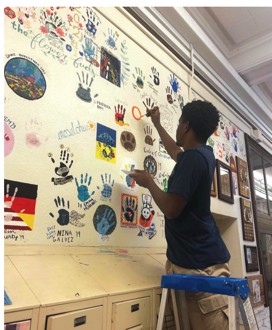
A graduating student paints their handprint on the wall of Uni High, marking the end of their five-year high school journey.

Uni High is a small school with approximately 65 students per grade (8 through 12), adding up to around 325 for the entire student body. Because of its small size, Uni High celebrates a tradition where the graduating class leaves handprints on the school building before they embark upon their next adventure. A week before graduation, the seniors go on ladders holding small plates ("palettes") of paint against the walls of Uni High. Students personalize their handprints by carefully designing it with colors and elements they feel represent themselves or their time at Uni High. Students also have the freedom to choose where to place their handprint, so it's common to put handprints next to friends and coordinate themes.