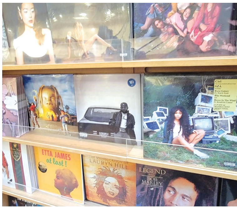
Examples of physical media are still prevalent, even with the threat of digital subscription services

Films were traditionally distributed by distribution companies that opened the movies into thousands of theaters nationwide on a weekly basis. This method is used to draw in hundreds of audience members to the theaters every week to watch the newest film. However, with the rise of subscription services, movie theaters are seeing a significant decrease in ticket sales and audi-