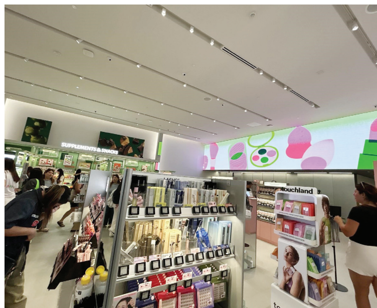
The new Olive Young store, displaying many brands, both Korean and American, had many shoppers eager to see what the store was all about.

The struggles did not disappear after the first lesson. Week after week, the ball aimlessly flew through the air every time I tried to get even slightly closer to the target. Improvement felt painfully slow, and there were many moments when I questioned whether the effort was worth it. Yet, over time, everything eventu-