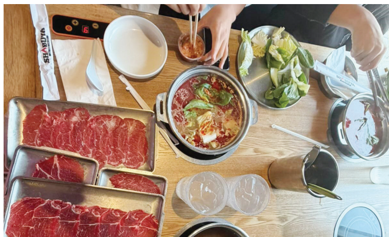
Having hangouts with friends and doing things like eating out is a memorable part of sophomore year.

theme, it is crucial to try your best not to procrastinate. Especially with bigger assignments, such as projects or information-heavy homework. Procrastination really affected me mentally and physically. I would just doomscroll and avoid the thought of homework, pushing it to the back of my mind. This would eventually cause me to stress out, and I definitely felt guilty. On top of that, cramming a project in one night physically fatigued