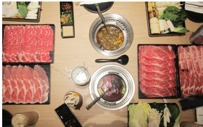
Although not exactly the same as the original, at Mumu Hot Pot, diners enjoy hot pot individually by cooking fresh vegetables and succulent meat in personalized pots.

Given the hot pot's deeply communal nature, I was in for a surprise when I visited Mumu Hot Pot with my friends and found that we would be dining from individual pots. We were also instructed to place our orders virtually through a QR code at our table while a server briefly explained the pot settings. As we instinctively reached for our phones, I