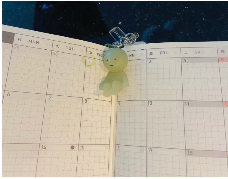
Using a planner to set aside time at the half-year point of the year to work on goal setting again can be very helpful.

However, it is not too late to start. You do not have to wait until next January First to attempt goals, or even set new ones. The hesitation to start can be seen in the habit of waiting until a five-minute increment of time to start a chore. Staring at the clock until it hits 8:25 instead of 8:21, then starting my work, is an experience I have had con-