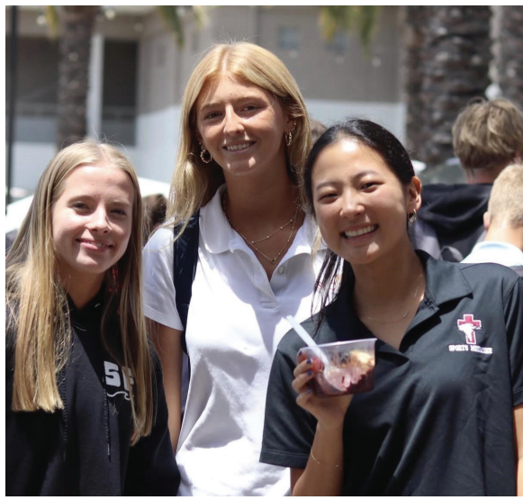
Three eleventh-grade students, including myself, enjoying lunch at Senior Business Week.

Senior year marks the time when most students become adults and have to make their own decisions for their lives. This means that they gain freedom, but also immense pressure to decide their futures and fully live independently. As a rising senior in the fall, I have already started to embrace this combination of freedom and pressure, and I've especially seen it play out in my older classmates who have now graduated. At Santa Fe Christian High School in San Diego, CA, the graduating senior class undergoes various final activities that promote unity amongst one another, their families, and the teachers. Such events make graduating seem a lot less daunting and more enjoyable—as if everyone is not