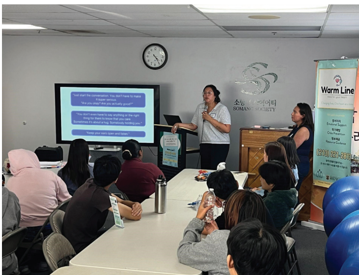
Participants listen as presenters explain the Question, Persuade, and Refer (QPR) method during a suicide prevention training.

Hosted by the YouStar Foundation at the start of summer, the training began with an online survey that asked questions about suicide prevention. Some questions inquired about how comfortable we felt asking someone if they were thinking about suicide, while others asked us to identify warning signs. As I answered, I quickly realized how much I still had to learn. Although I thought I knew the basics, I wasn't as confident in my knowledge on this topic as I expected.