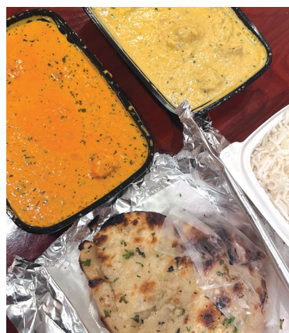
The Chicken Coconut Curry, Chicken Tikka Masala, and Garlic Naan paired with white basmati rice offered me a new cultural experience of India.

At first, I was a bit nervous about trying food from a different culture because although I would consider myself a foodie, I tend to eat at the same restaurants I've been to and loved instead of experimenting