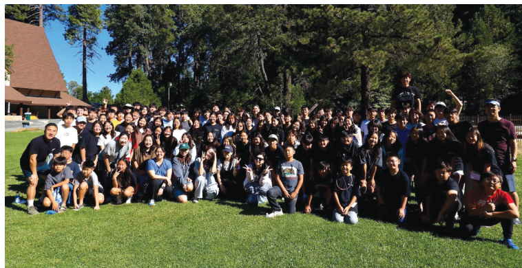
Hanbit Church poses for a group photo at their 2026 summer retreat, "Thrive."

One of the most engaging aspects of the weekend was the division of students into small game groups. Many of these groups