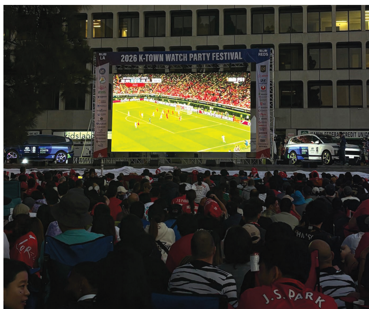
Community, culture, and soccer come together as fans pack Liberty Park for the World Cup watch party.

As the match began, the announcer led the crowd in singing the Korean national anthem and chanting traditional cheers. The energy was contagious. Guided