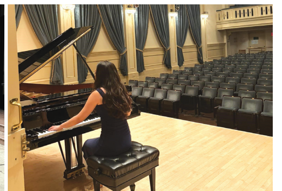
A Music For Sharing student practices on the piano at Carnegie Hall during the June 14 concert.

in the performance, I can say that walking into Carnegie Hall was an unforgettable experience. The historic venue has a level of prestige that immediately stands out, even before I could start thinking about sound checks. From rehearsal on to the final show, a charged feeling could be felt and was shared by all of the performers. Months of preparation had been building up to this, and everyone seemed ready to make the most of the opportunity and stage.