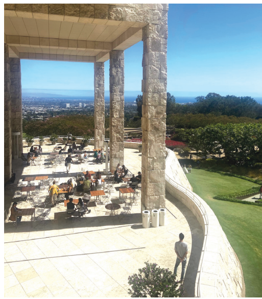
The Getty Center offers amazing panoramic views of Los Angeles where you can relax and take pictures.

The art inside the museum was fantastic as well. Although many exhibitions were closed when I visited, there were still many interesting and valuable pieces to explore. The most famous one was definitely Vincent Van Gogh's Irises (1889). Even