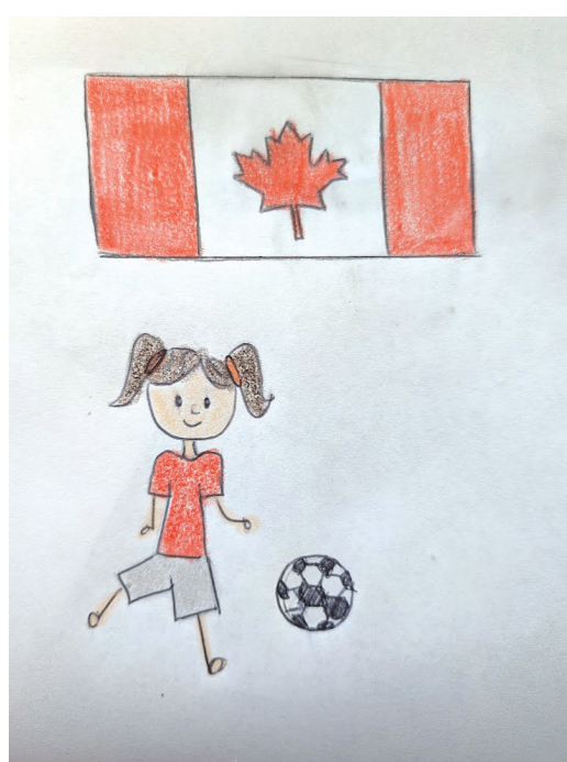
Fifty percent of Canadian youth participate in soccer, making it Canada's most widely played sport amongst children.