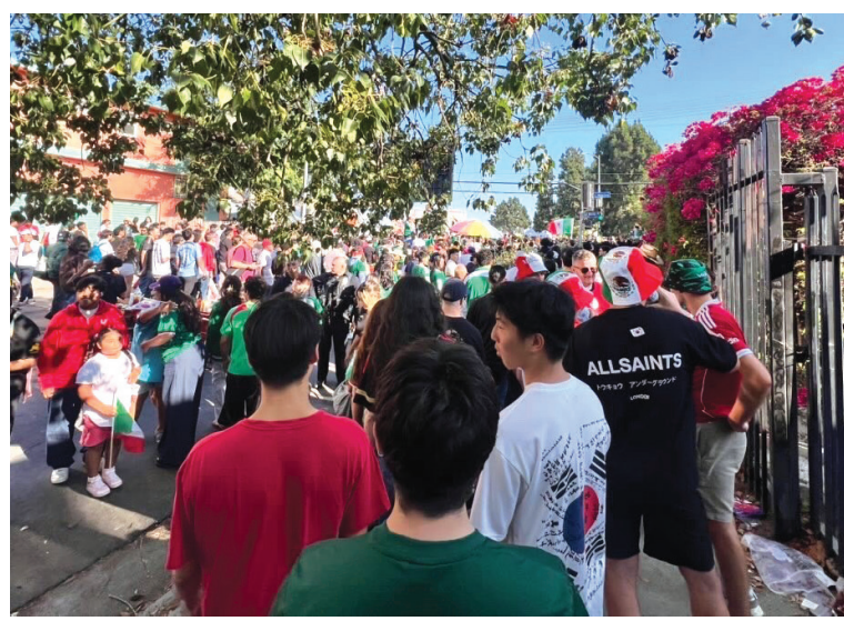
A shot of Korean and Mexican fans gathering to watch a World Cup game together in their neighborhood.

This brotherhood did not come out of nowhere, but rather a match of the World Cup Russia 2018, on June 27. Mexico had played very well early on, but suffered a loss to Sweden in their final group stage match. In order to move on to the round of sixteen, Mexico was desperately relying on a heavily unfavored team, South Korea, to defeat or at least draw with the reigning World Cup champions of the time, Germany. Defying all expectations, the South Korean team pulled off a 2-0 victory and eliminated Germany, sending Mexico to the round of 16 while not advancing themselves. The reaction of Mexican fans was extremely joyous