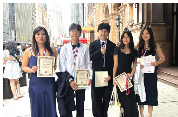
Music For Sharing members pose in front of Carnegie Hall before their June 14 performance in New York City.

The nonprofit's commitment to service has enabled young mu-